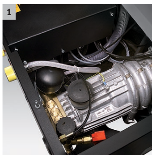
1 Water-cooled 4-pole electric motor (oil-heated)