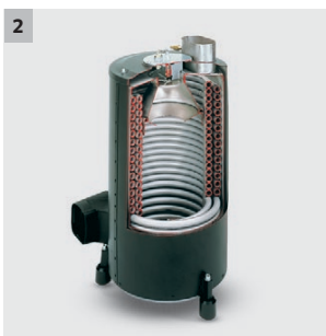
2 Burner technology (oil-heated)