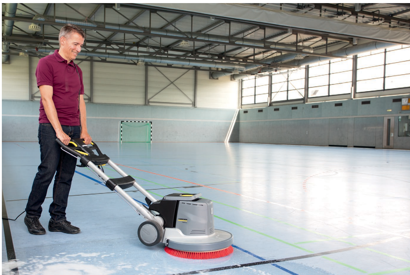
BDS 51/180 C Adv