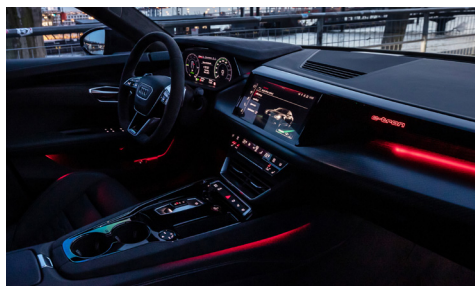
Fast charging with DC at up to 270 kW and AC at up to 11 kW