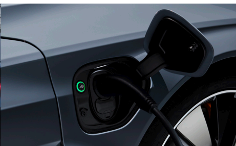
Fast charging with DC at up to 270 kW and AC at up to 11 kW