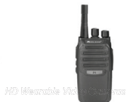
Business 2-Way Radios