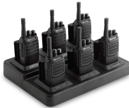
BRB200X6BGC BR200 6-Radio Pack *2nd slot batteries not included

* The listed ranges are based on field testing and may vary with your operating conditions