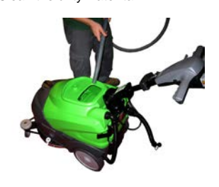
Check the detergent output filter is undamaged and clean.