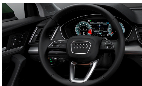
3-spoke leather steering wheel with multifunction plus