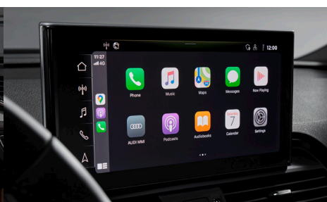
MMI navigation plus with MMI touch