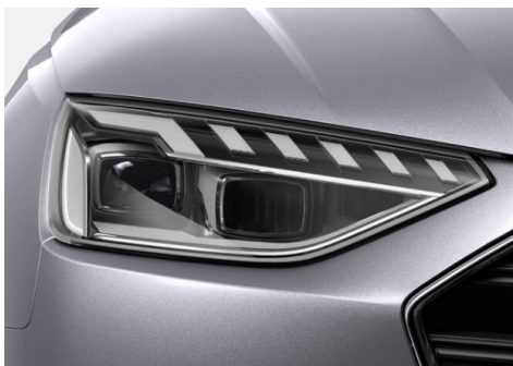
LED headlights with headlight washers