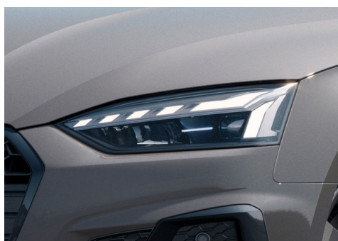
Matrix LED headlights