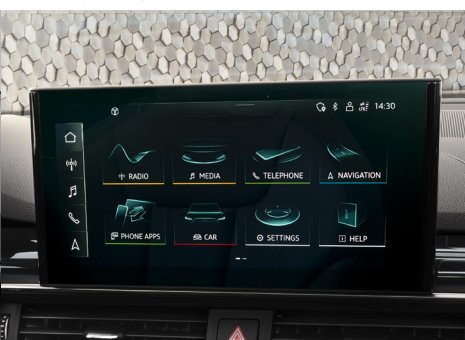
MMI navigation plus with MMI touch