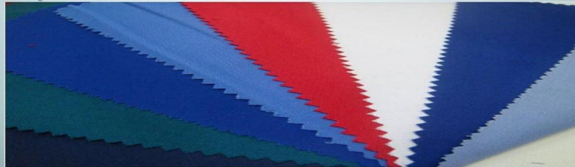
INNER LAYER – 100% COTTON ANTI-BACTERIA