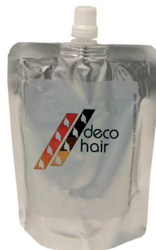
Stand-Up cream decolorant

• Going in the reverse direction is a different situation: from more intense to less intense (from red to copper, to gold, etc.). This type of change always involves a preparatory step, with a decoloring wash that is needed to change the intensity of the existing highlight of the hair and replace it with a new one.