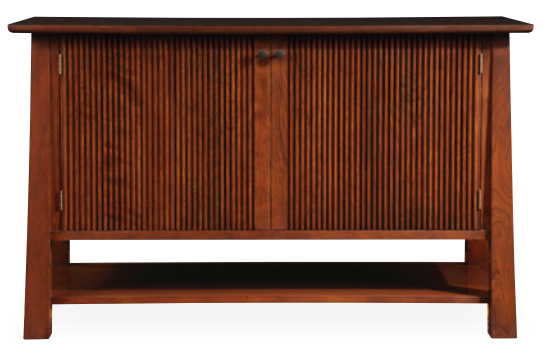
Park Slope Entertainment Console 1572 | H32 W52 D22

Each piece of Stickley Furniture is made to order, allowing you to customize the piece's ultimate look. For Park Slope, choose white oak for a deeply grained, dimensional appearance, or cherry for a subtler grain, rich in patina. These attributes are also affected by a variety of finish options, which can lend the same piece of furniture a modern or traditional look. And because wood mellows with age, developing its own rich glow, time itself is the final element that makes each piece from Stickley a wise investment and a unique work of art.