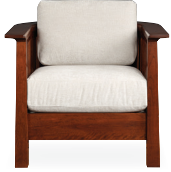
Park Slope Chair 1562 | H29 W34.5 D35.25