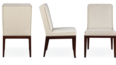
Park Slope Shelter Chair 1533 | H36 W21.5 D25.5

The Park Slope trestle table has a distinctly modern feel. At its base, spindles are arranged in two broad bows to provide a fresh perspective from every direction. The shape is echoed in the subtle, perfect curves that form the Park Slope shelter chairs.