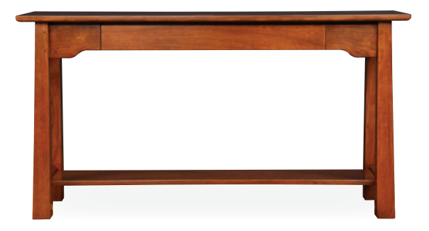
Park Slope Console Table 1567 | H29 W56 D16