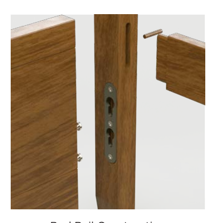
Bed Rail Construction

To showcase the inherent beauty of fine solid hardwoods, Stickley drawer fronts are made from a single wide board. This costly technique eliminates the unsightly glue lines, color variation, and grain inconsistency found in lesser drawer fronts