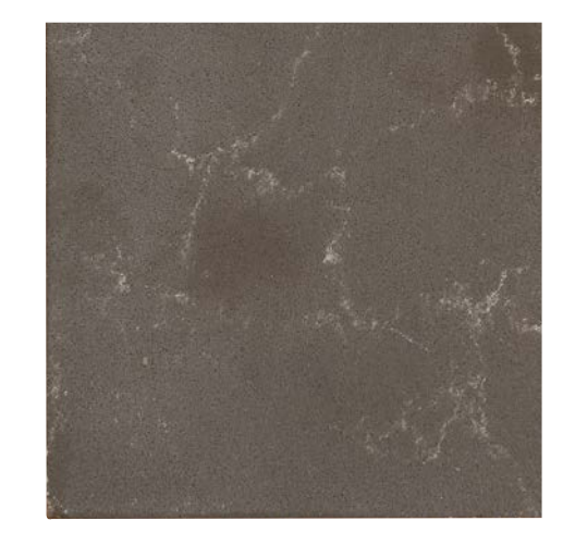
Sealed quartz tops make practical, stain-resistant surfaces.