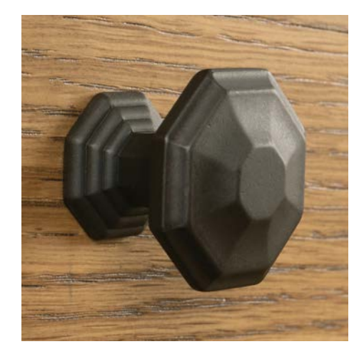
Storage pieces are subtly ornamented with octagonal knobs of darkened metal.