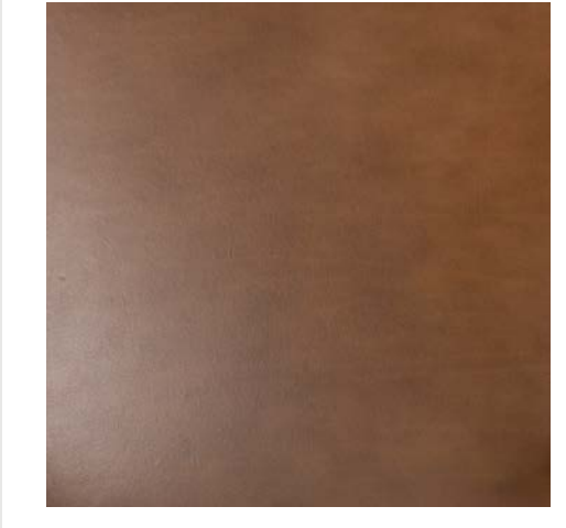
Mason Brown performance leather is soft and supple, yet highly durable and fade resistant.