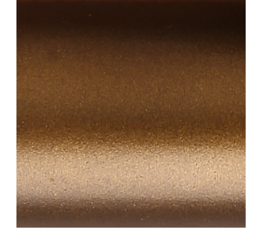
Quiet metals live alongside our beautiful oak to create an airy, contemporary style.