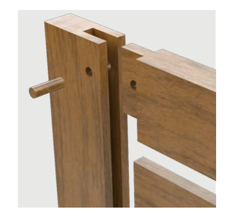
Pinned Mortise-and-Tenon Joinery

The center guide keeps drawers from skewing sideways. Side suspension keeps them level when heavily loaded. There are no plastic parts to break, no metal to rust and scratch—just honest-to-goodness hand craftsmanship. The drawer never scrapes the bottom and opens and closes with ease—forever.