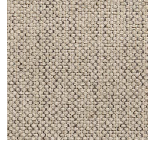
Dining chairs are protected from spills with our linen-colored Crypton textured fabric.