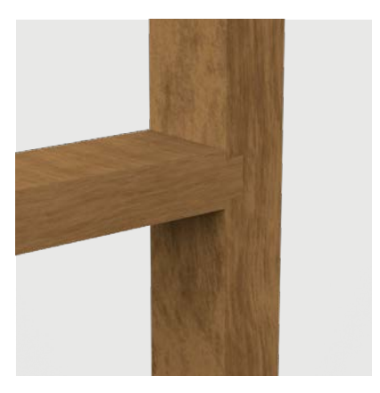
Dovetailed Cross Rails

We use top-quality 5/4" solid oak for the St. Lawrence bed rails. Two panhead screws are positioned at the ends of each rail to lock into an iron casting with a tongued slot. The end rails are mortised and tenoned into the posts and secured with wooden pins. As a result, our beds won't wobble or rock.