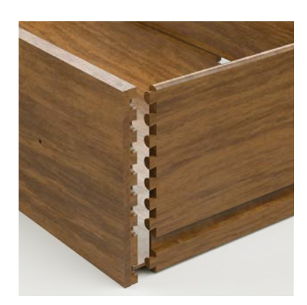
One-Piece Drawer Fronts

A signature element of Stickley construction is the tenon: a board whose ends have been cut for insertion into a mortise. Many Stickley joints are tenoned glued, and pinned with wooden pins. The pins lock the joint, supplying additional strength. This joint would hold together even without the use of glue. Some styles are pinned from the front and are visible, others from the back.