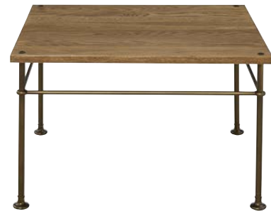
St. Lawrence Metal Bunching Cocktail Table

Product number: 8142 Dimensions: W30 D30 H18