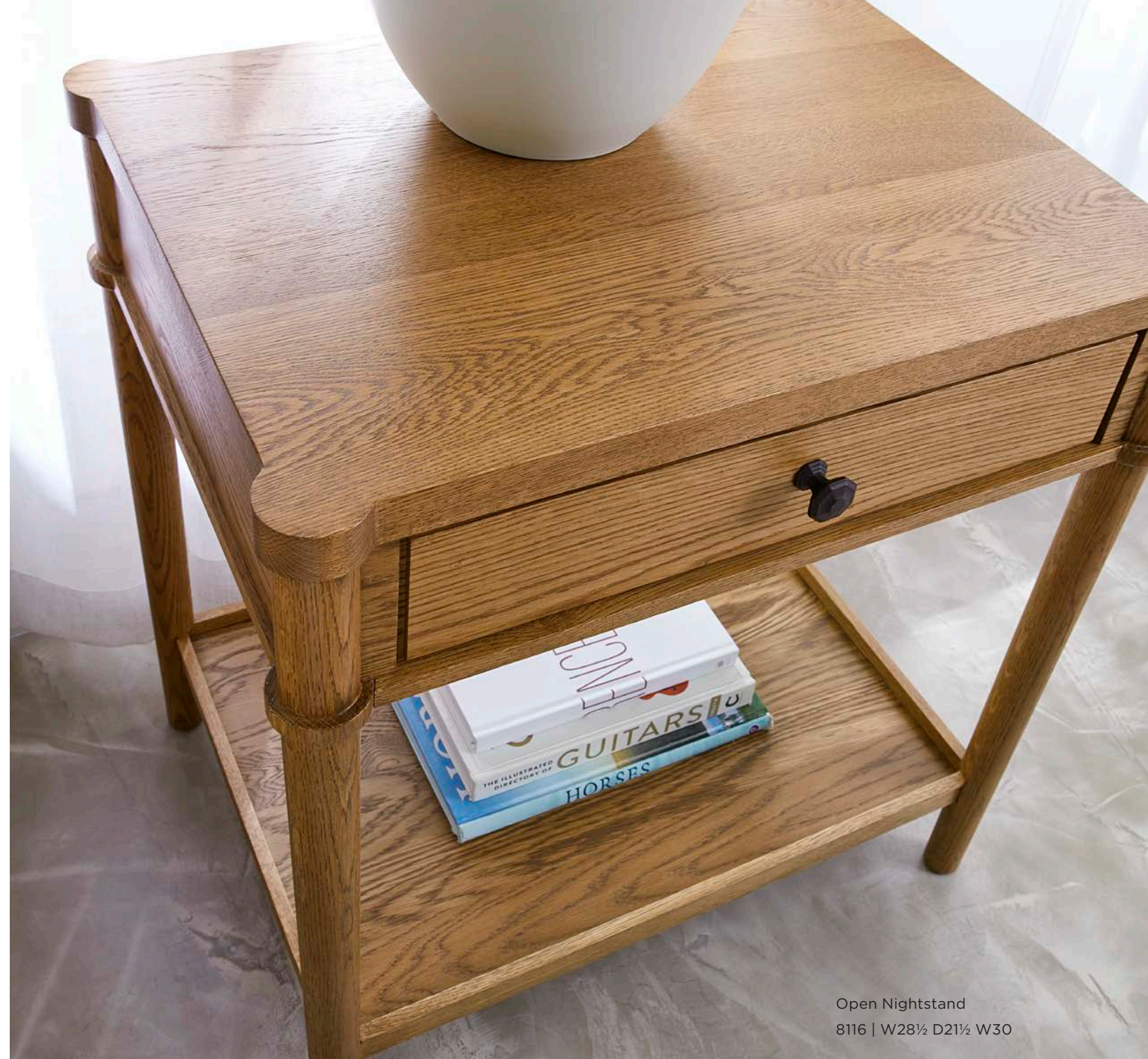
Open Nightstand 8116 | W28½ D21½ W30

COVER: Bed, King Nightstand 8110-K | W84¾ D87½ H64½ 8115 | W32 D19½ H30