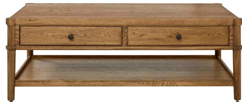
St. Lawrence Post Cocktail Table

Bay Brown finish on wire-brushed solid oak. Solid wood top. Turned wood base connected with aprons.