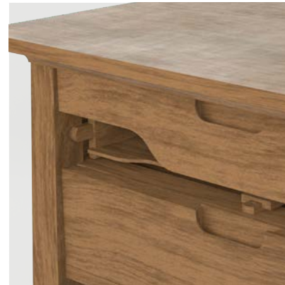
Side-Hung and Center-Guided Drawers

At Stickley, we share a philosophy akin to Gustav Stickley's "Als ik kan," from the Flemish meaning "to the best of my ability." Our mission is to offer honest craftsmanship, inherent value, and unmatched service. We invite you to discover The Stickley Difference, because not all furniture is created equal.