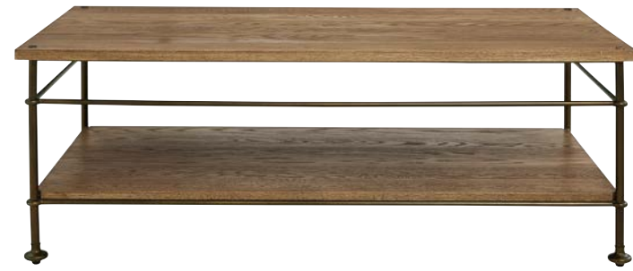
St. Lawrence Metal Rectangular Cocktail Table

Bay Brown finish on wire-brushed solid oak. Metal frame in Antique Bronze. Round metal legs pierce top and end in machined end caps. Horizontal stretchers on all four sides. Bunch multiple tables to create large, versatile surfaces.