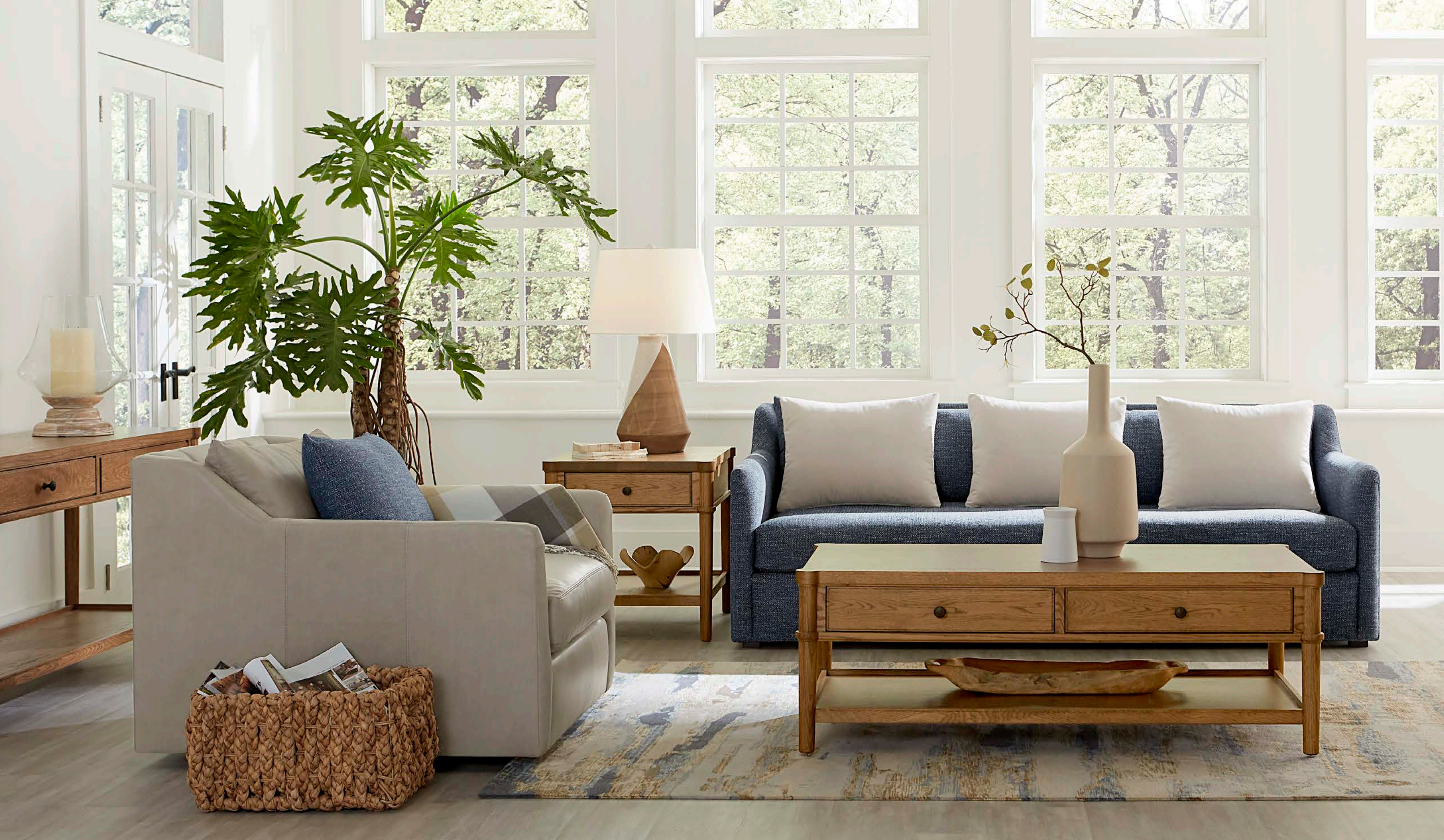
Post Cocktail Table 8130 | W52 D26 H18