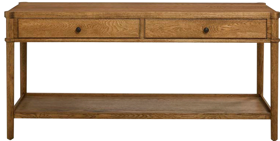
St. Lawrence Post Console Table

Product number: 8131 Dimensions: W62 D18 H29