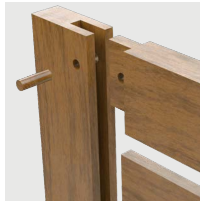
Pinned Mortise-and-Tenon Joinery

The center guide keeps drawers from skewing sideways. Side suspension keeps them level when heavily loaded. There are no plastic parts to break, no metal to rust and scratch—just honest-to-goodness hand craftsmanship. The drawer never scrapes the bottom and opens and closes with ease—forever.