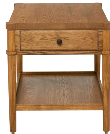
St. Lawrence Post End Table

Bay Brown finish on wire-brushed solid oak. Solid wood top. Octagonal hardware in darkened metal finish. Two side-hung, center-guided drawers and one fixed shelf. Round tapered posts extend to top.