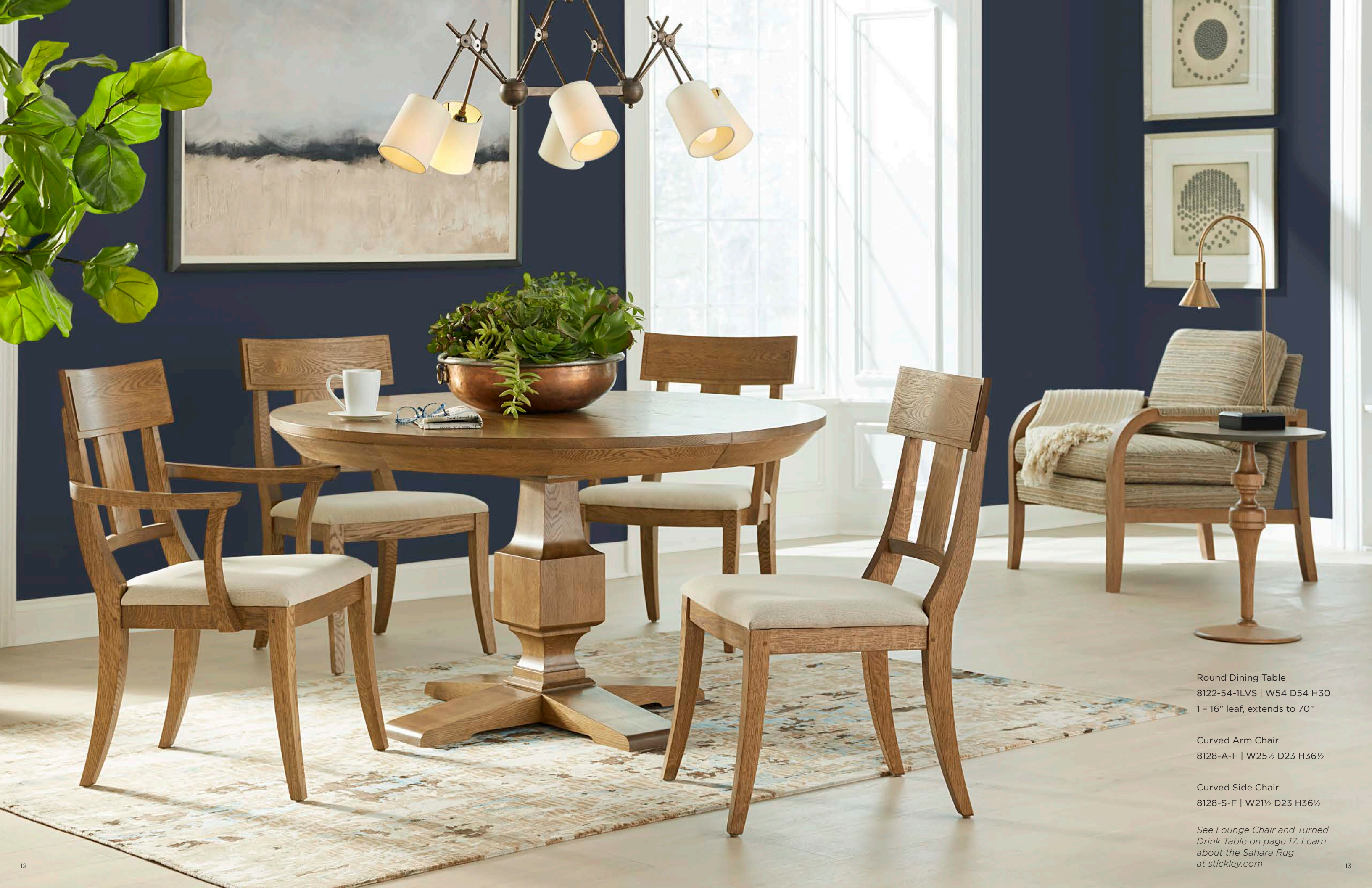
Round Dining Table 8122-54-1LVS | W54 D54 H30 1 - 16" leaf, extends to 70"