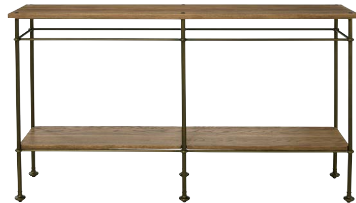
St. Lawrence Metal Console Table

Bay Brown finish on wire-brushed solid oak. Metal frame in Antique Bronze. Round metal legs pierce top and end in machined end caps. Horizontal stretchers on all four sides.