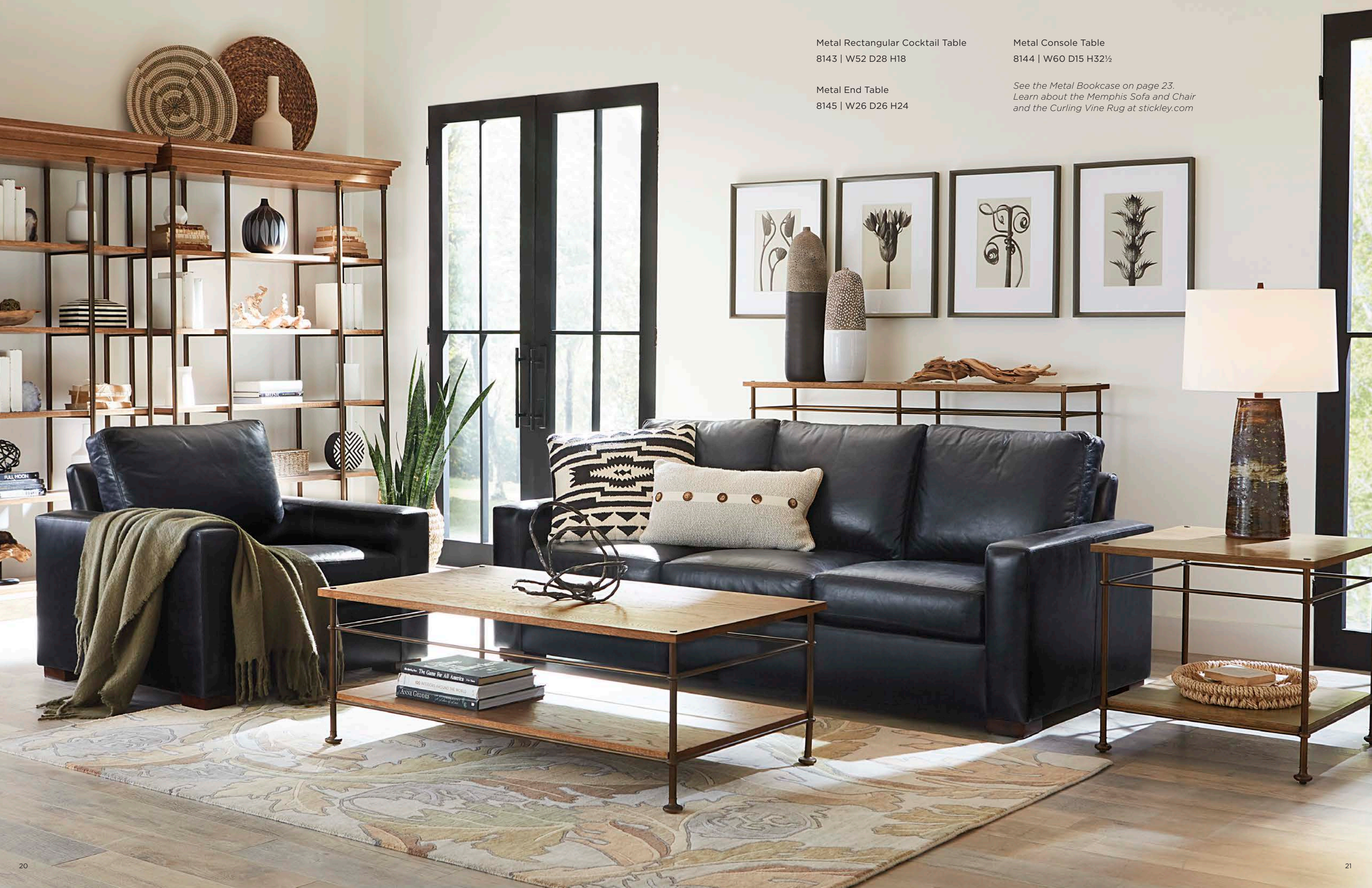
Metal Rectangular Cocktail Table 8143 | W52 D28 H18