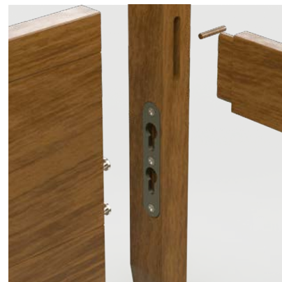
Bed Rail Construction

To showcase the inherent beauty of fine solid hardwoods, Stickley drawer fronts are made from a single wide board. This costly technique eliminates the unsightly glue lines, color variation, and grain inconsistency found in lesser drawer fronts.