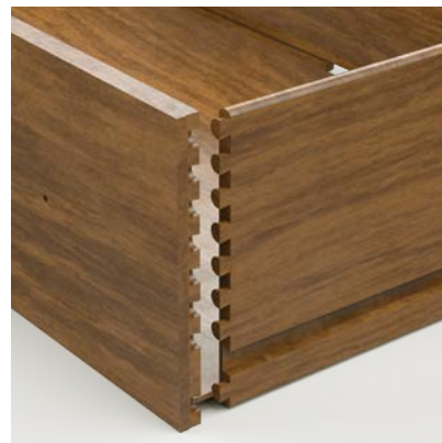
One-Piece Drawer Fronts

A signature element of Stickley construction is the tenon: a board whose ends have been cut for insertion into a mortise. Many Stickley joints are tenoned, glued, and pinned with wooden pins. The pins lock the joint, supplying additional strength. This joint would hold together even without the use of glue. Some styles are pinned from the front and are visible, others from the back.