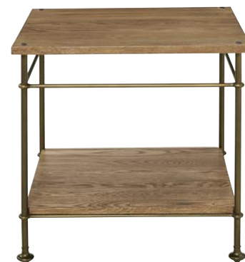
St. Lawrence Metal End Table

Bay Brown finish on wire-brushed solid oak. Metal frame in Antique Bronze. Round metal legs pierce top and end in machined end caps. Horizontal stretchers on all four sides. One fixed wooden shelf.