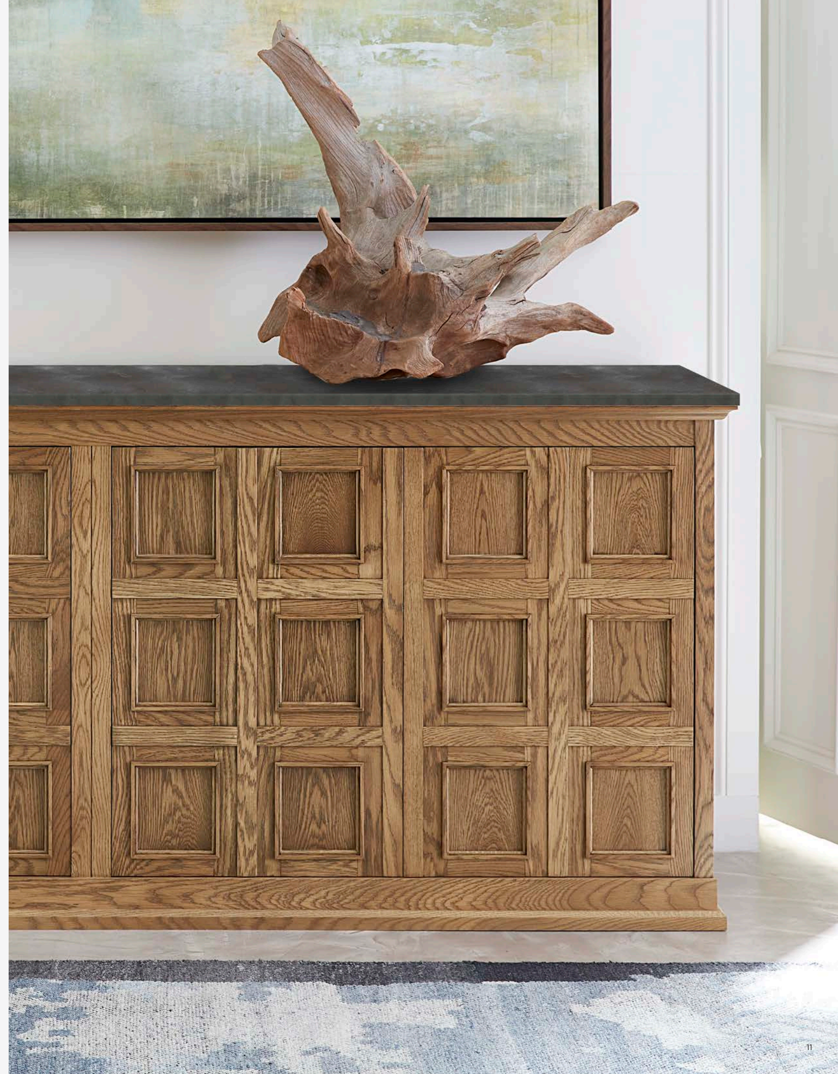
Buffet 8126-ST | W83 D21 H34½

Look closely at the forms that make up St. Lawrence, and you'll appreciate our updated approach to traditional millwork. In every room you'll see bold silhouettes and striking surface textures—effects that are created with cleanly carved moldings, recessed panels, and squared-off bands that give a contemporary edge to the typical turned base or leg.