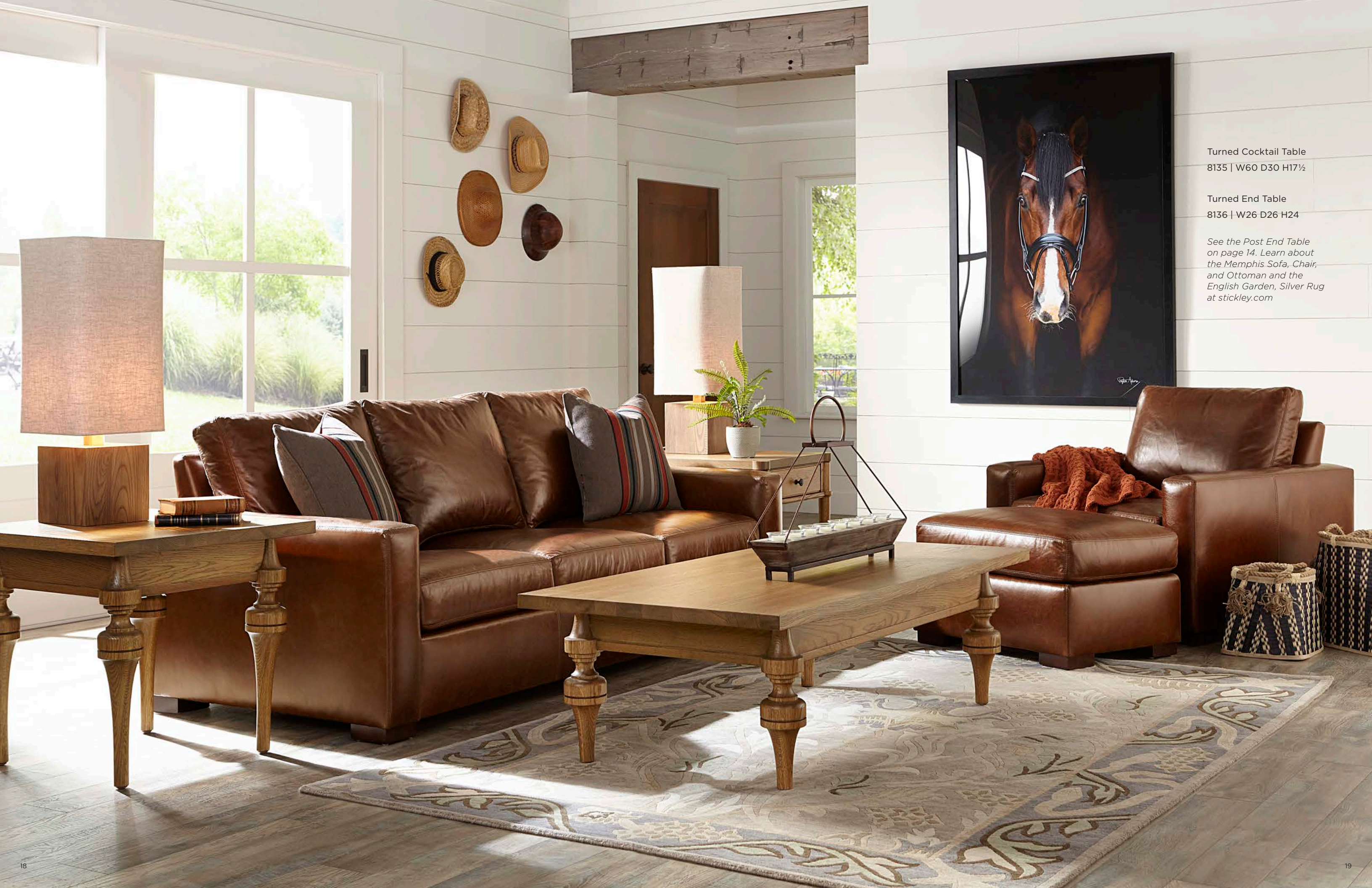
Turned Cocktail Table 8135 | W60 D30 H17½