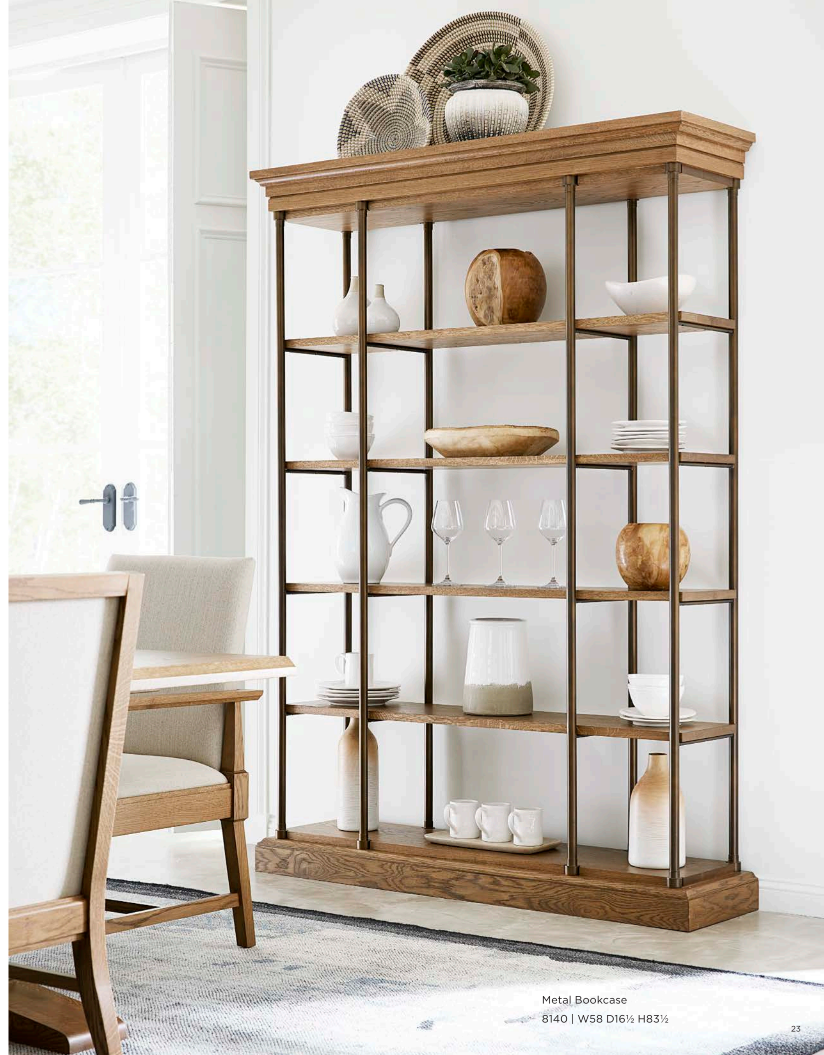
Metal Bookcase 8140 | W58 D16½ H83½

Quiet metals live alongside our beautiful oak to create an airy, contemporary style.