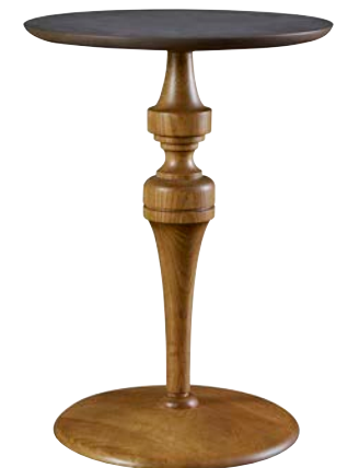
St. Lawrence Turned Drink Table

Bay Brown finish on wire-brushed solid oak. Solid wood top. Turned wood base connected with aprons.