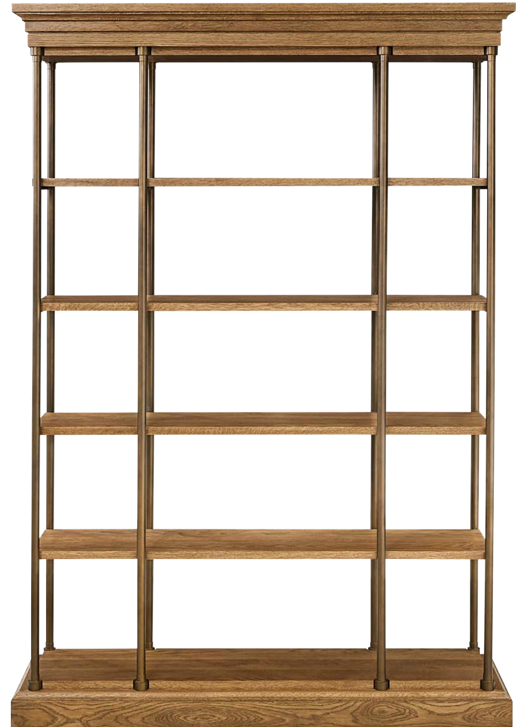
St. Lawrence Metal Bookcase

Bay Brown finish on wire-brushed solid oak. Metal frame in Antique Bronze. Round metal legs pierce top and end in machined end caps. Horizontal stretchers on all four sides. One fixed wooden shelf.