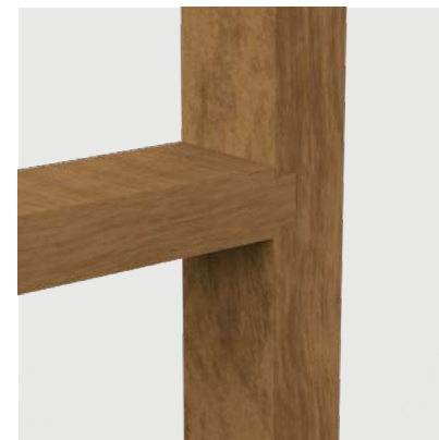
Dovetailed Cross Rails

We use top-quality 5/4" solid oak for the St. Lawrence bed rails. Two panhead screws are positioned at the ends of each rail to lock into an iron casting with a tongued slot. The end rails are mortised and tenoned into the posts and secured with wooden pins. As a result, our beds won't wobble or rock.