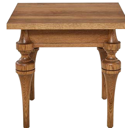
St. Lawrence Turned End Table

Bay Brown finish on wire-brushed solid oak. Solid wood top. Octagonal hardware in darkened metal finish. One side-hung, center-guided drawer and one fixed shelf. Round tapered posts extend to top.