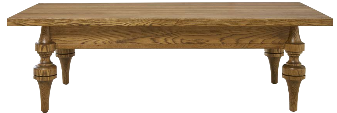
St. Lawrence Turned Cocktail Table

Bay Brown finish on wire-brushed solid oak. Solid wood top. Octagonal hardware in darkened metal finish. Two side-hung, center-guided drawers and one fixed shelf. Round tapered posts extend to top.