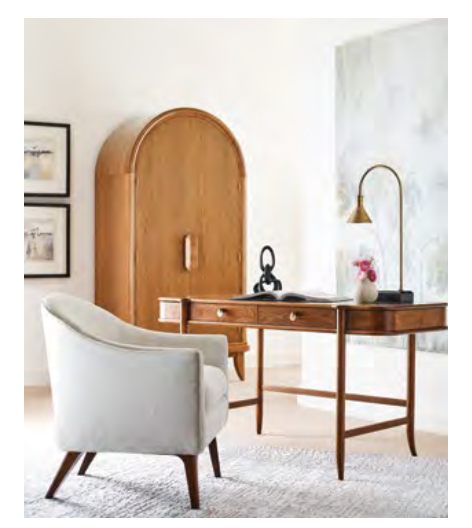
Martine page 10

Martine showcases the warmth and exuberance of cherry, but smoothed, rounded, and softened—a softness you want to reach out and touch.