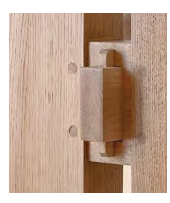
Mortise-and-Tenon Joinery A signature element of Stickley

This cut yields top-grade boards featuring ray flake patterning, and it binds the perpendicular fibers together, giving the oak its amazing strength.