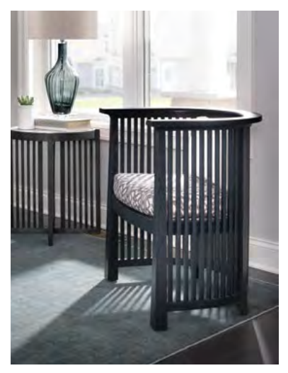
Park Slope page 36

Our Little Treasures are modestly scaled pieces with a variety of uses, each built with traditional Arts and Crafts materials, techniques, and details.