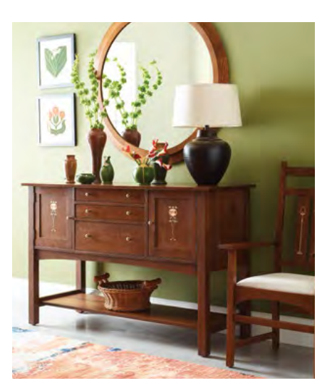
Harvey Ellis page 34

The Highlands Collection preserves Mission lines and style while appearing distinctly modern, thanks to the influence of Scottish Arts and Crafts.