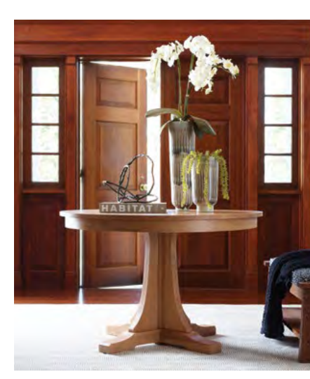
Mission page 30

Walnut Grove's curvy, mid-century modern design incorporates lots of open space, creating pieces and whole rooms that feel buoyant and fresh.