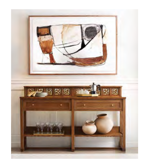
Surrey Hills page 24

For those who dream up rooms in a mix of looks, Portfolio120 offers eclectic objects and capsule collections designed to go alongside any style.