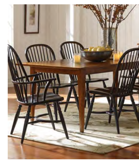
Nichols & Stone by Stickley page 42

Crafted by skilled artisans from the world's best wool, our rugs represent the finest quality and artistry and become heirlooms for generations to enjoy.