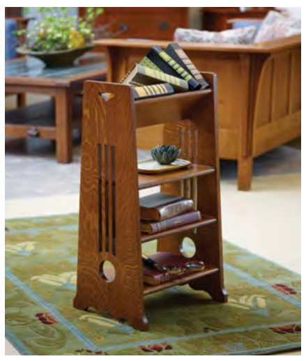
Little Treasures page 29

Inspired by British Arts and Crafts designers who celebrated nature in the home, Surrey Hills brings nature indoors with an organic trellis-and-vine motif.