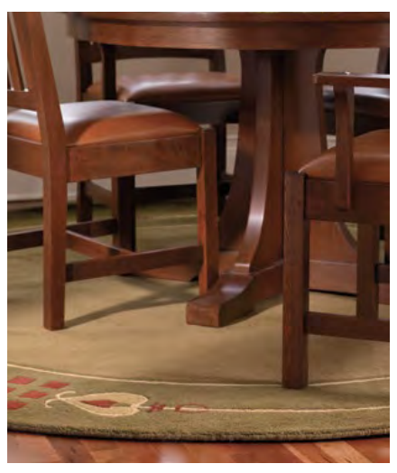
Stickley Designer Rugs page 40

Park Slope starts with familiar Mission features like spindles and reverse-tapered posts, then evolves the style with softer organic curves.