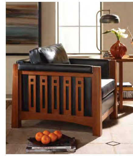
Highlands page 32

Stickley's American-made Mission furniture continues to celebrate honest materials, clean, practical forms, and lasting craftsmanship.