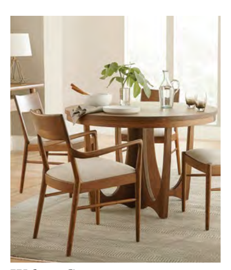
Walnut Grove page 15

Martine showcases the warmth and exuberance of cherry, but smoothed, rounded, and softened—a softness you want to reach out and touch.