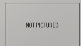
WATER-RESISTANT COVER (INCLUDED) #68860