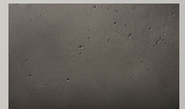
TEXTURED CONCRETE-LOOK FINISH