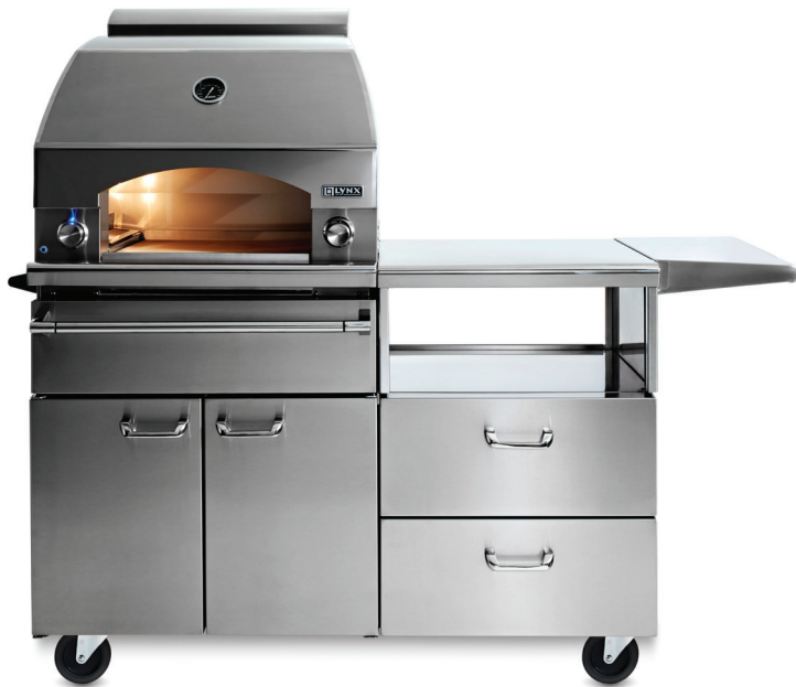
SHOWN ON 54" MOBILE KITCHEN CART