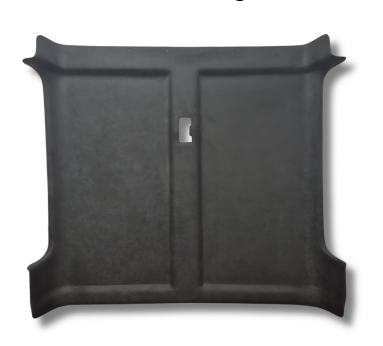
Rear Headlining Section