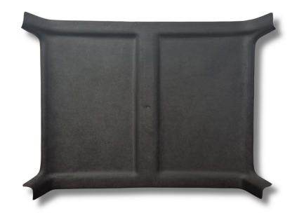
Middle Headlining Section