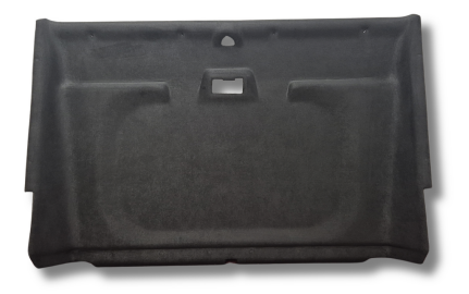
Front Headlining Section