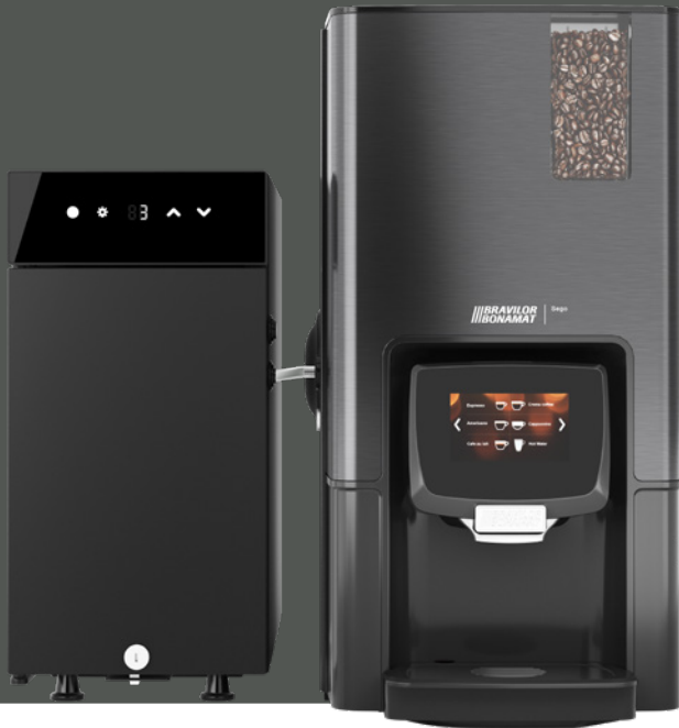
Sego L Fresh Milk with milk fridge