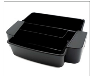
drip tray for pedestal