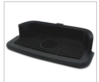
lower drip tray grid