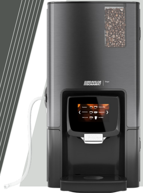
Sego L Fresh Milk without milk fridge