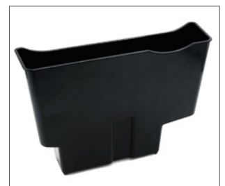
waste bin for pedestal