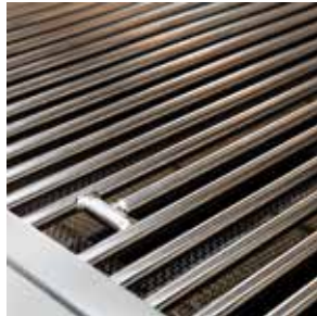
EXPANSIVE GRILLING SURFACE