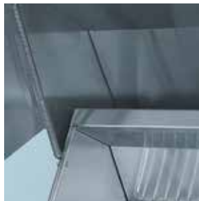
LYNX HOOD ASSIST

FOR MORE INFORMATION ON LYNX PROFESSIONAL PRODUCT FEATURES, PLEASE VISIT LYNXGRILLS.COM