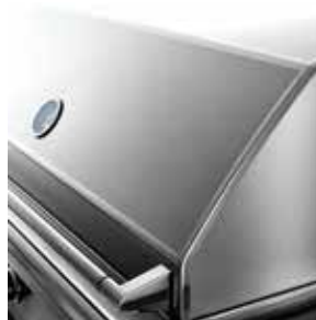
SEAMLESS WELDED CONSTRUCTION