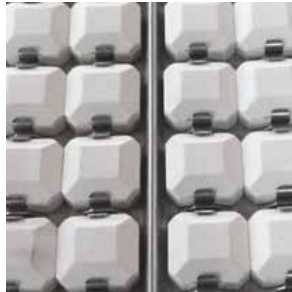
CERAMIC RADIANT BRIQUETTES