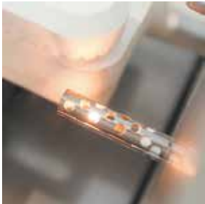
HOT SURFACE IGNITION