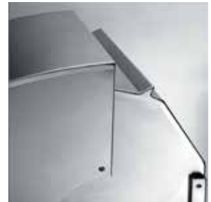
HEAT STABILIZING DESIGN