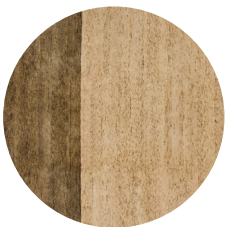
Camel & Chocolate