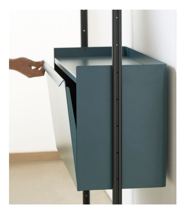
Numerous work, wardrobe or organisational functions can be incorporated.