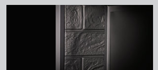
BRICK SIDE PANEL