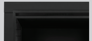
OPTIONAL 3/4PC TRIM KIT