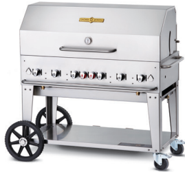
Shown with optional Roll Dome

Our passion at Crown Verity is to bring the precision and performance of commercial kitchens to the outdoor environment. To that end we design and manufacture our grills to be reliable and go beyond traditional industry specifications.