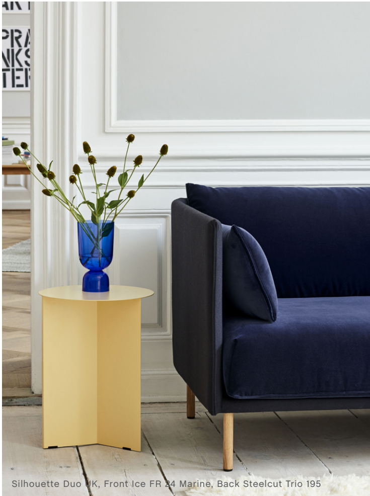
Silhouette Duo UK, Front Ice FR 24 Marine, Back Steelcut Trio 195