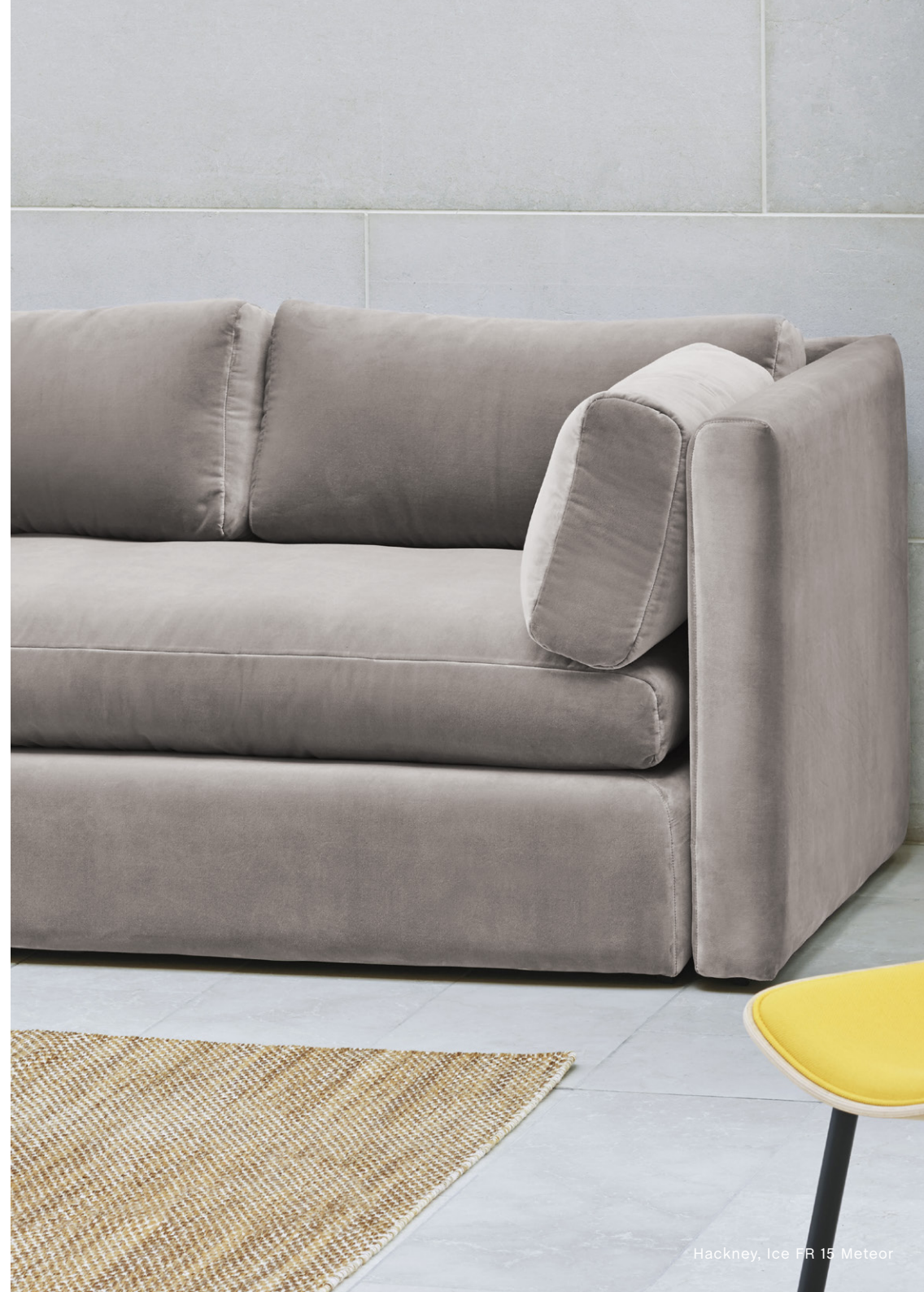
Hackney, Ice FR 15 Meteor