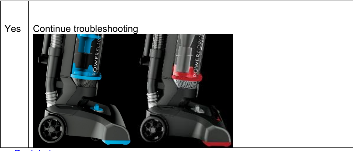
Back to top

> Are there cracks in the hose or lower hose?