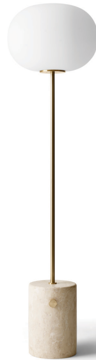
Travertine / Brushed Brass 1840619