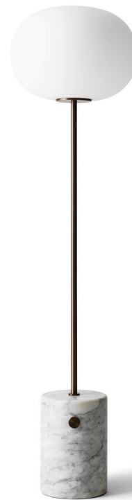
Carrara Marble / Bronzed Brass 1840639