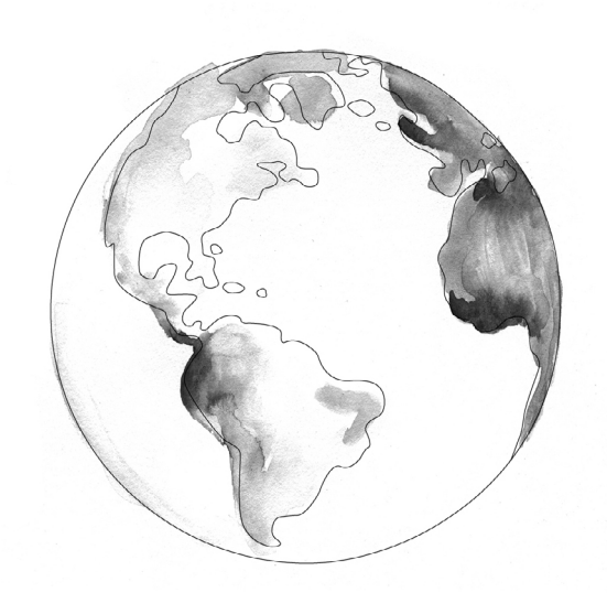
Considering the planet, its resources and its people.