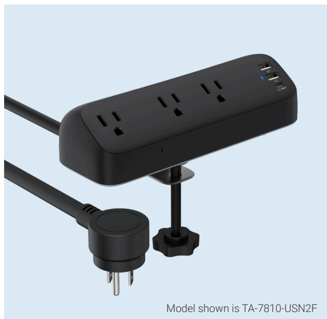
Model shown is TA-7810-USN2F