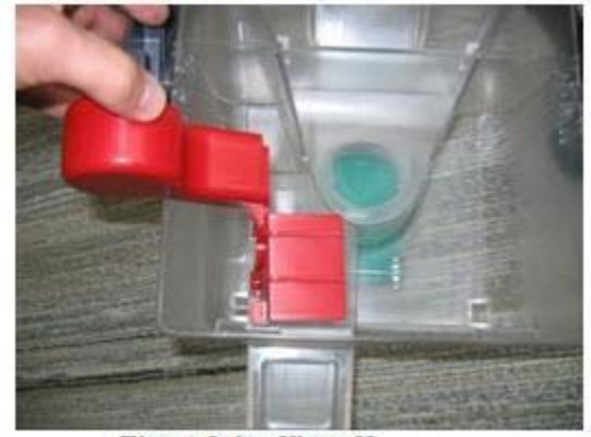
Float & baffle off

6. If you still don't have suction, please take your deep cleaner to a technician. You can find your nearest BISSELL® Authorized Service Center