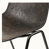
Coffee Waste Black

The shell of the Eternity chair is made of Matek®. Innovative technology allows us to recycle fibre-based waste materials with recycled plastic waste. The Chair itself is a very comfortable, functional stackable chair with industrial and sculptural features. Eternity is designed for disassembly, meaning that the design allows each component in its purest form to recycle into new production circles.