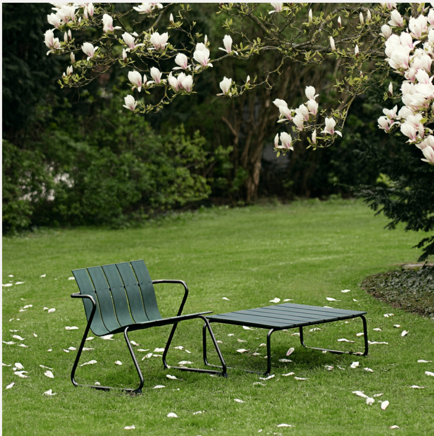
Ocean OC2 lounge chair & Ocean OC2 lounge table

An OC2 seat made from upcycled beer kegs from Carlsberg saves up to 53 per cent in CO 2 emissions compared to a similar made of plastic, which corresponds to approximately three kilos less CO 2 .