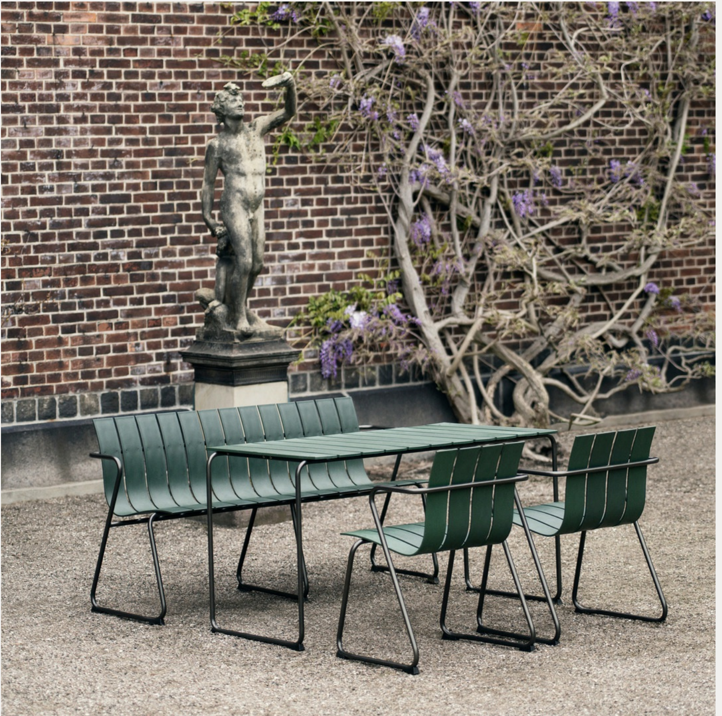
Ocean OC2 bench, Ocean OC2 4 pers. table & Ocean OC2 chair

Sustainable, circular production solutions have been the focal point since Mater saw the light of day in 2006. With the launch of the first Ocean products in 2019, Mater was also the first to use upcycled fishing nets and ocean waste plastic to make furniture. Now the time has come to look into other upcycled materials and waste.