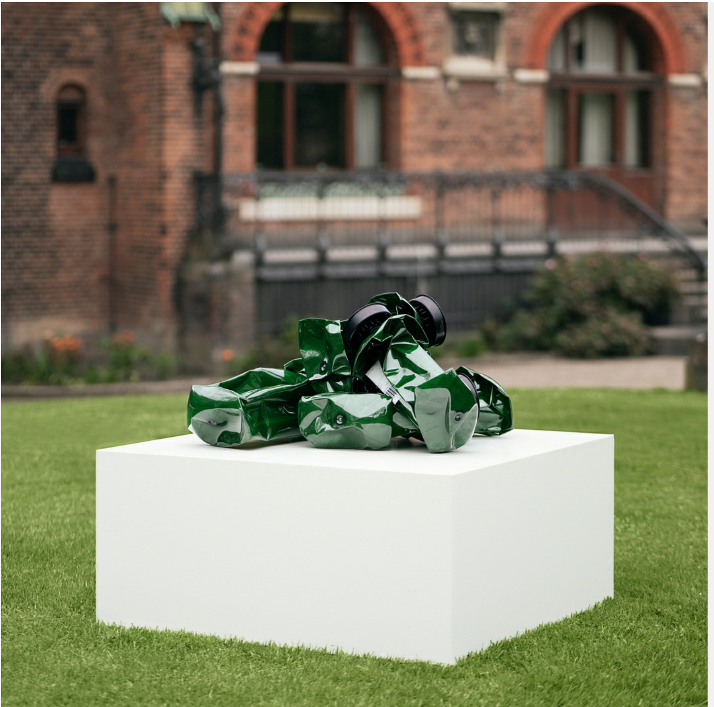
Empty DraughtMaster beer kegs from Carlsberg

Mater has teamed up with Carlsberg and the company Re-Plastic to reproduce one of the 20th century's most renowned design couples, Nanna and Joergen Ditzel's outdoor furniture.