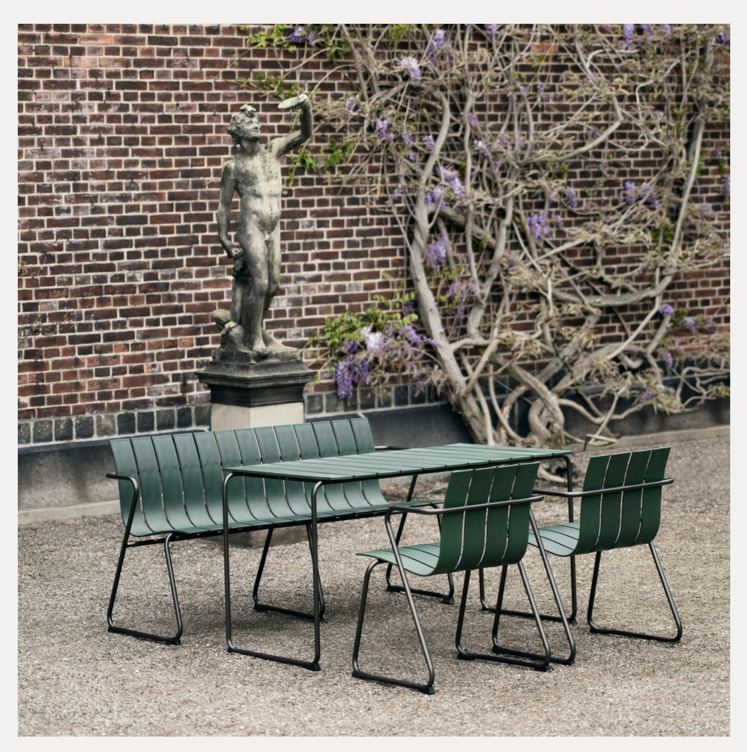
Ocean OC2 bench, Ocean OC2 4 pers. table & Ocean OC2 chair

Sustainable, circular production solutions have been the focal point since Mater saw the light of day in 2006. With the launch of the first Ocean products in 2019, Mater was also the first to use upcycled fishing nets and ocean waste plastic to make furniture. Now the time has come to look into other upcycled materials and waste.