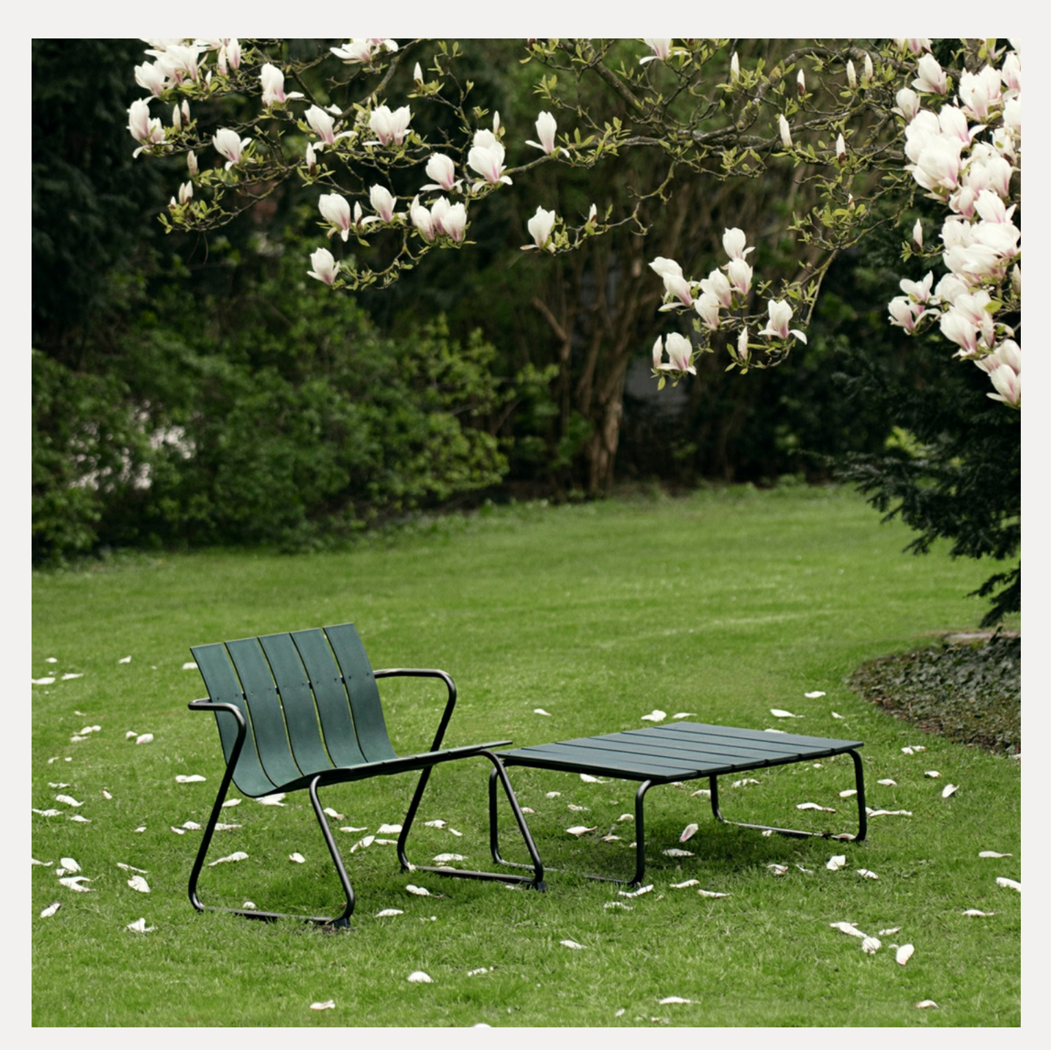
Ocean OC2 lounge chair & Ocean OC2 lounge table

An OC2 seat made from upcycled beer kegs from Carlsberg saves up to 53 per cent in CO2 emissions compared to a similar made of plastic, which corresponds to approximately three kilos less CO2.