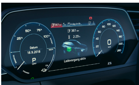
Audi virtual cockpit plus