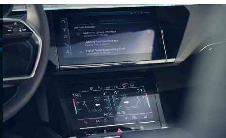
MMI navigation plus with MMI touch response