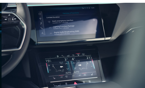
MMI navigation plus with MMI touch response