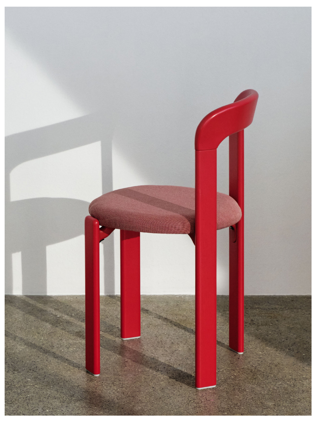
Scarlet red, Steelcut Trio 636