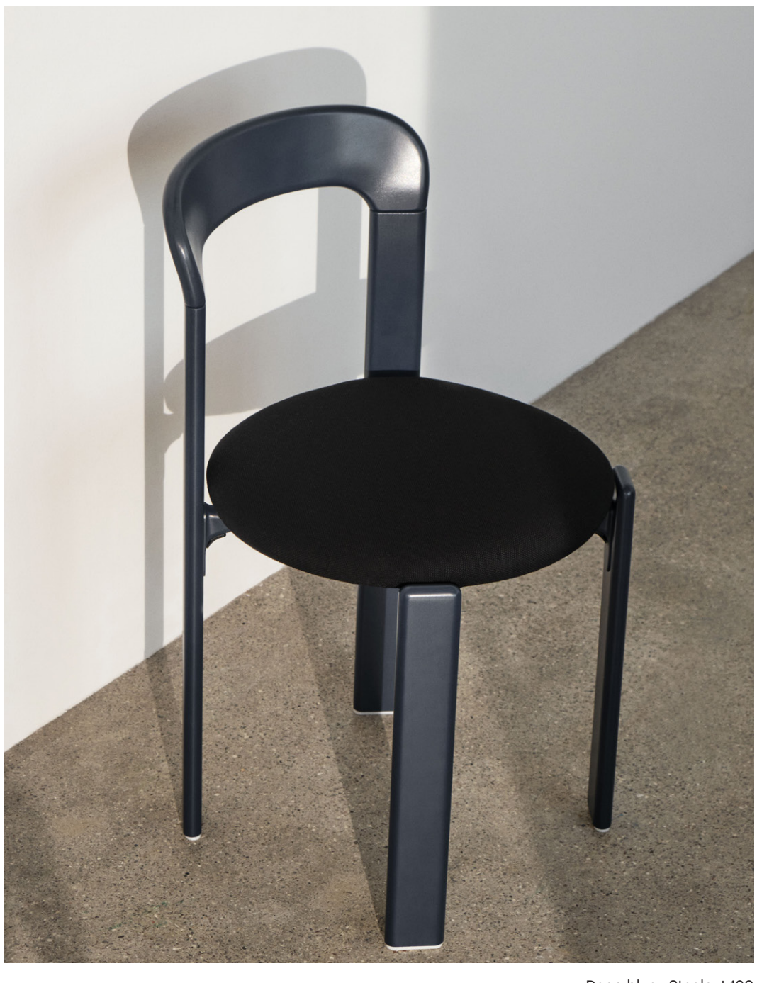
Deep blue, Steelcut 190