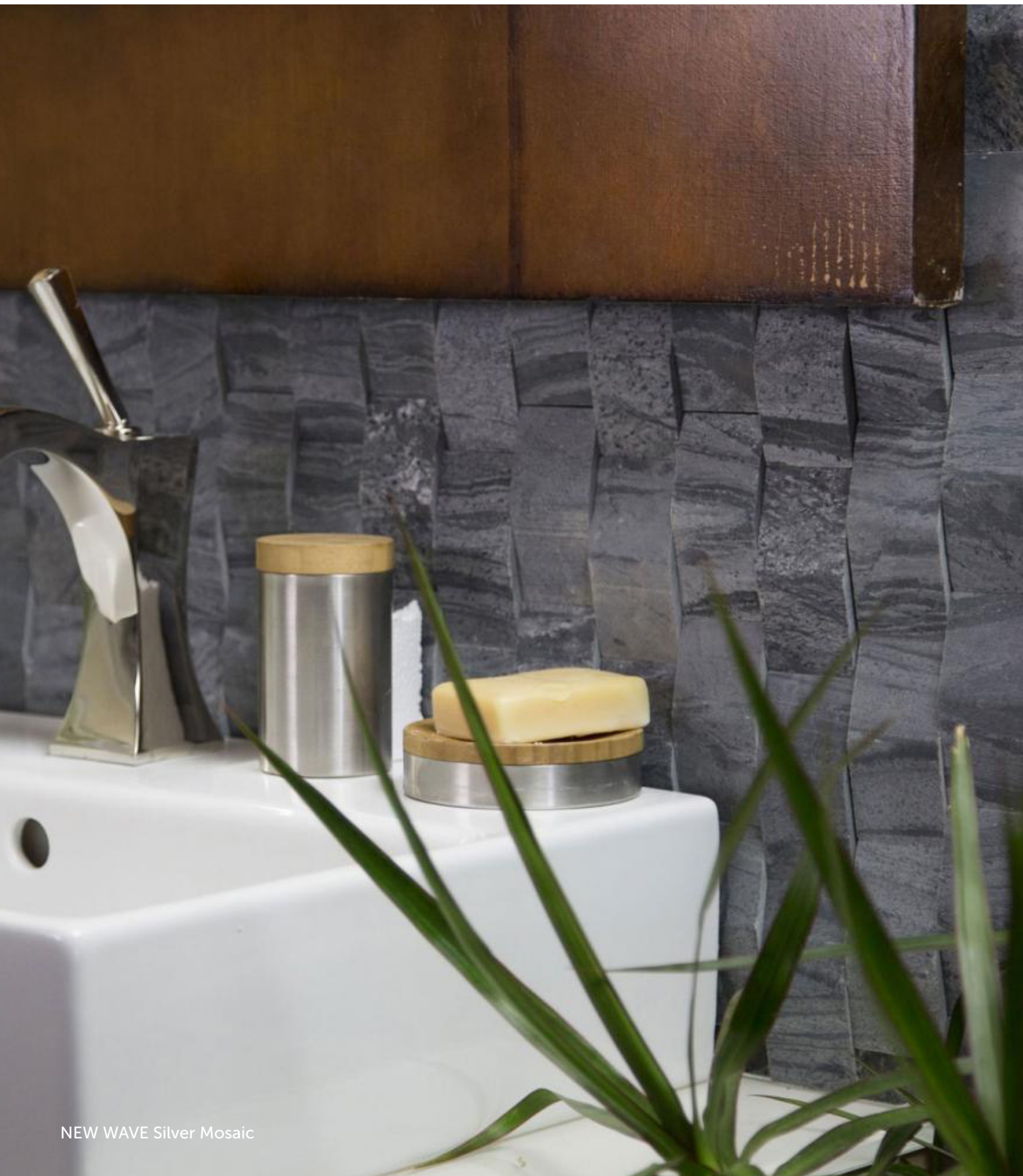
NEW WAVE Silver Mosaic