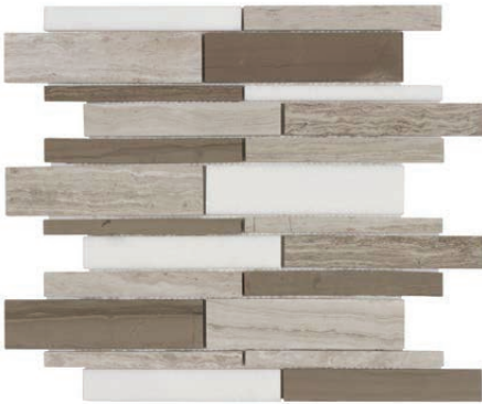
Villager - ANTHRHI 12"x12" Coverage: 1 sqft/pc