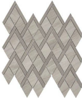
Paramount - ANTHRHPA* 12"x15" Coverage: 0.967 sqft/pc