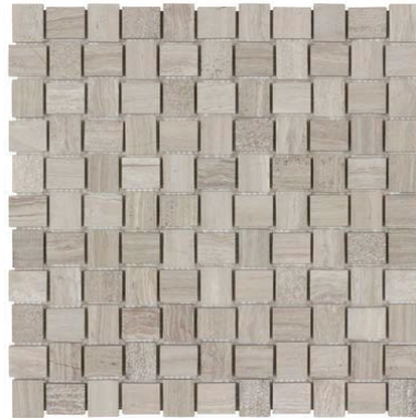
Sandstone - ANTHRISA 12"x12" Coverage: 0.969 sqft/pc