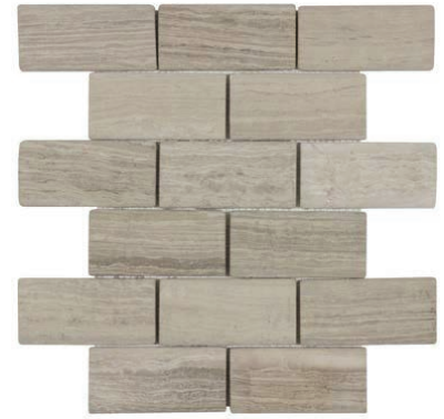
Stoney Fields - ANTHRHSF 10"x12" Coverage: 0.808 sqft/pc