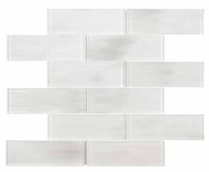
Blizzard Mix 12"x12" Coverage: 0.97 sqft/pc