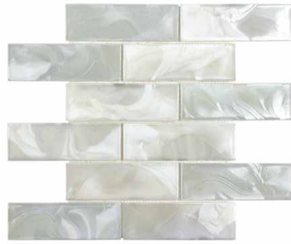
Moonglow 12"x12" Coverage: 0.96 sqft/pc