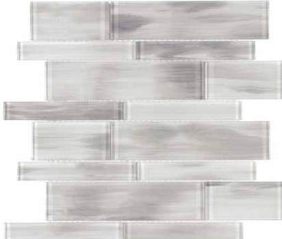
Cyclone Mix 12"x12" Coverage: 0.97 sqft/pc