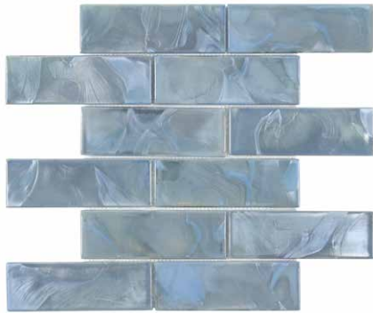
Waterspout 12"x12" Coverage: 0.96 sqft/pc