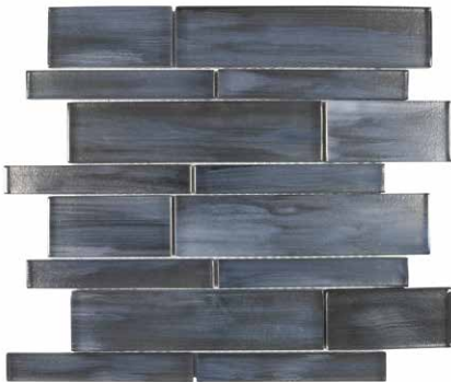
Storm Mix 12"x12" Coverage: 0.97 sqft/pc