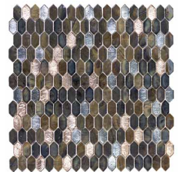
Smoky Quartz 12"x12"