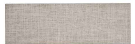
Sisal Beige 4"x12" Coverage: 0.323 sqft/pc