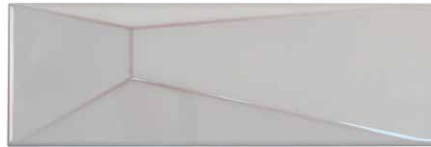
Manhattan Grey 4"x12" Coverage: 0.323 sqft/pc