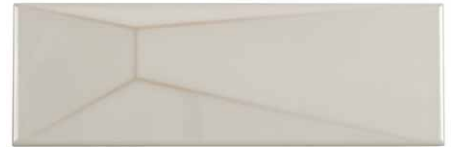
Manhattan Beige 4"x12" Coverage: 0.323 sqft/pc