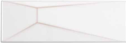
Manhattan White 4"x12" Coverage: 0.323 sqft/pc