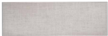
Sisal White 4"x12" Coverage: 0.323 sqft/pc