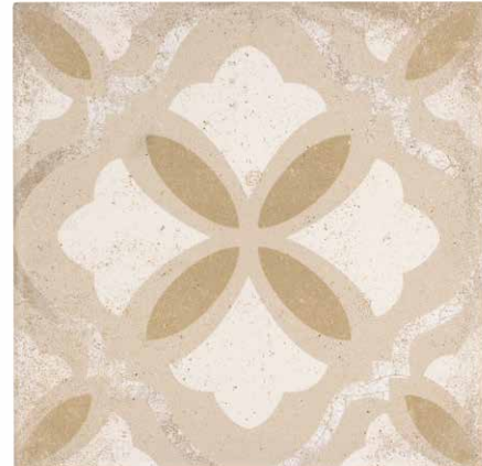
Seville - 9"x9" Coverage: 0.539 sqft/pc *sold by the box