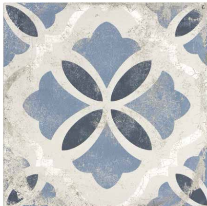
Madrid - 9"x9" Coverage: 0.539 sqft/pc *sold by the box