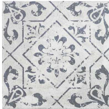
Palma - 6"x6" Coverage: 0.239 sqft/pc *sold by the box