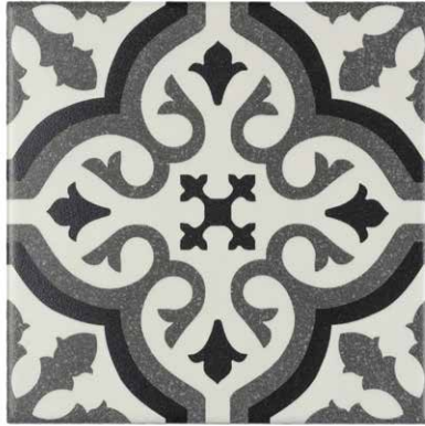
Aragon - 6"x6" Coverage: 0.239 sqft/pc *sold by the box