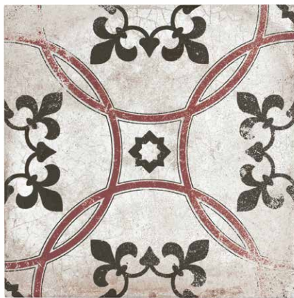
Granada - 9"x9" Coverage: 0.539 sqft/pc *sold by the box