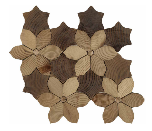
Mytosis 11" x 13" (1 SF/Sheet)