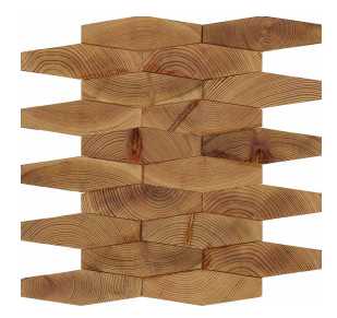
Long Hex 3D 11" x 13" (0.99 SF/Sheet)