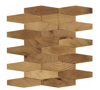
Long Hex 11" x 13" (0.99 SF/Sheet)