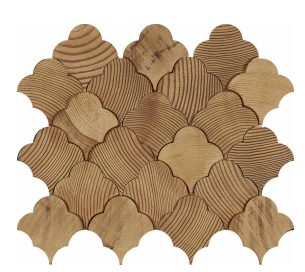
Scallop 3D 11" x 13.25" (1.01 SF/Sheet)