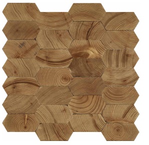
Honeycomb 12" x 12.5" (1.03 SF/Sheet)