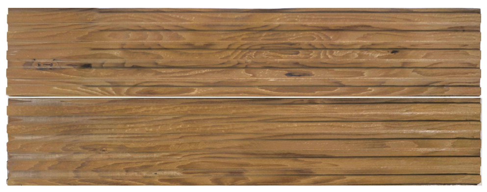
Channel 3.86" x 19.69"