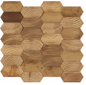
Honeycomb 3D 12" x 12.5" (1.03 SF/Sheet)