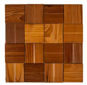
Cascades 12" x 12" (1 SF/Sheet)