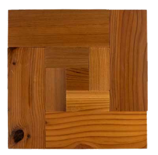
Milano 12" x 12" (1 SF/Sheet)