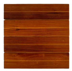
Lodge 12" x 12" (1 SF/Sheet)