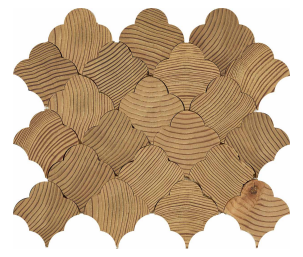
Scallop 11" x 13.25" (1.01 SF/Sheet)