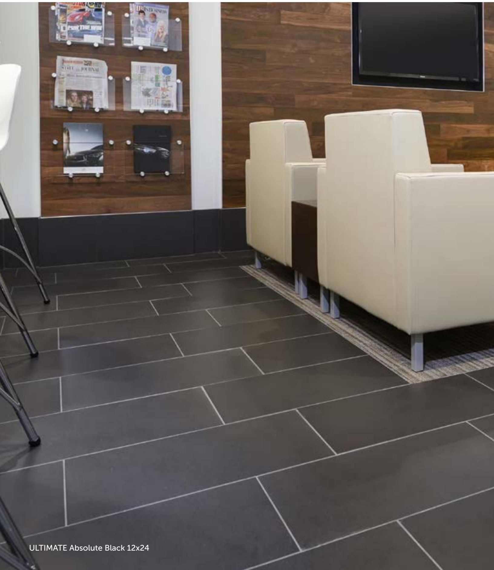
ULTIMATE Absolute Black 12x24