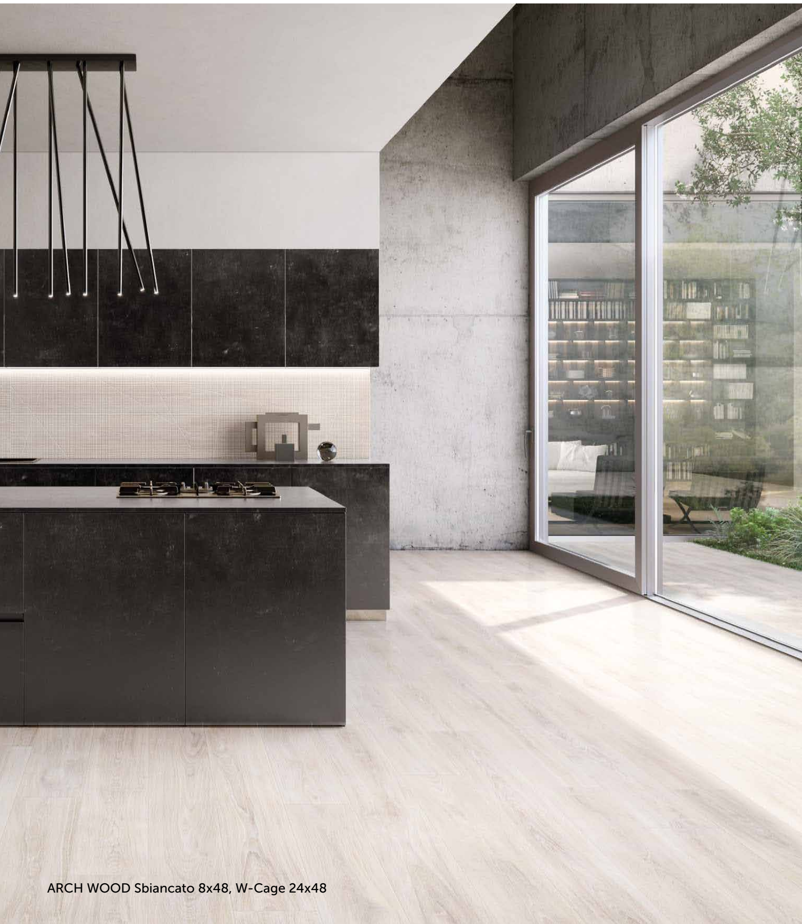
ARCH WOOD Sbiancato 8x48, W-Cage 24x48