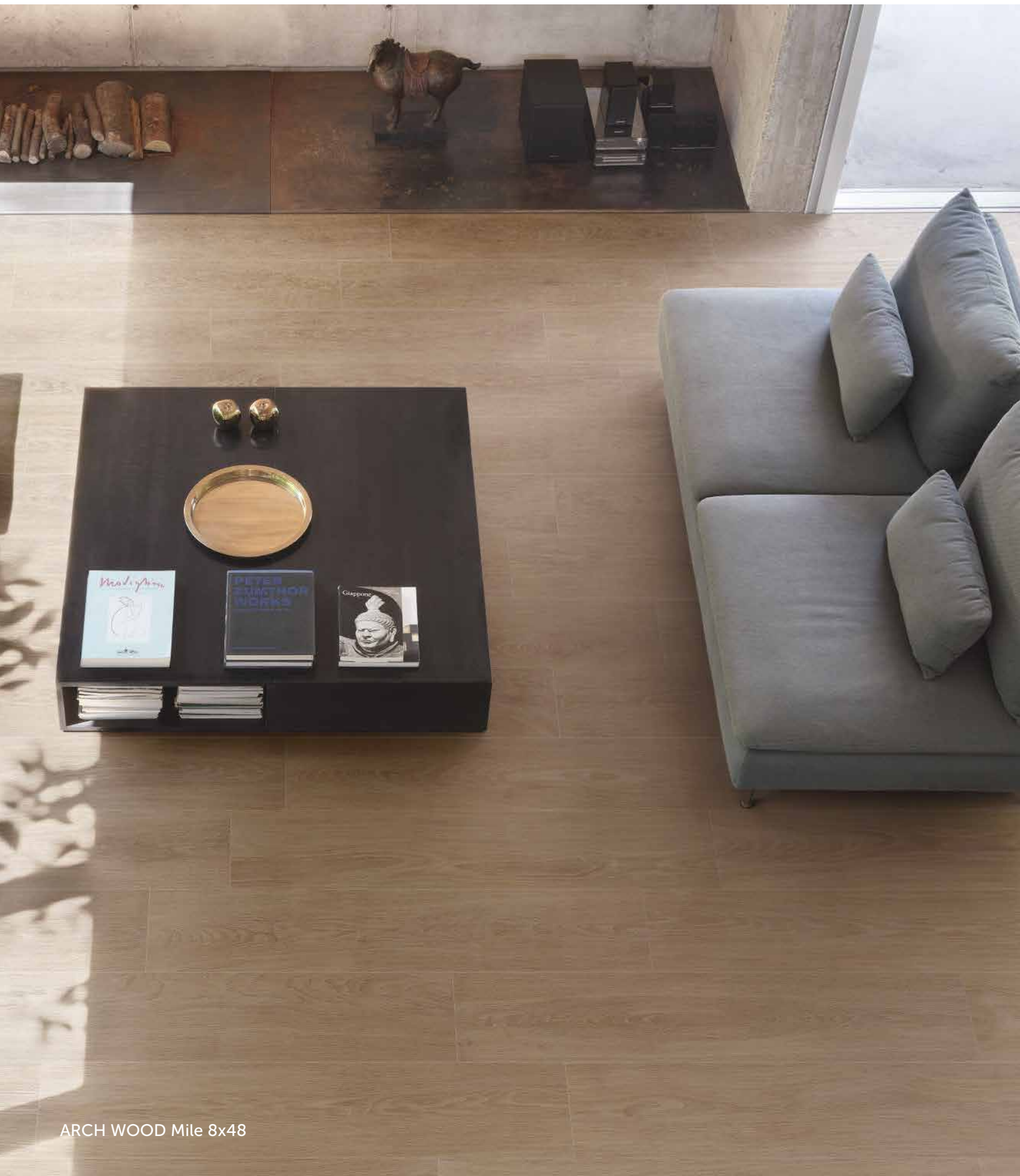
ARCH WOOD Mile 8x48