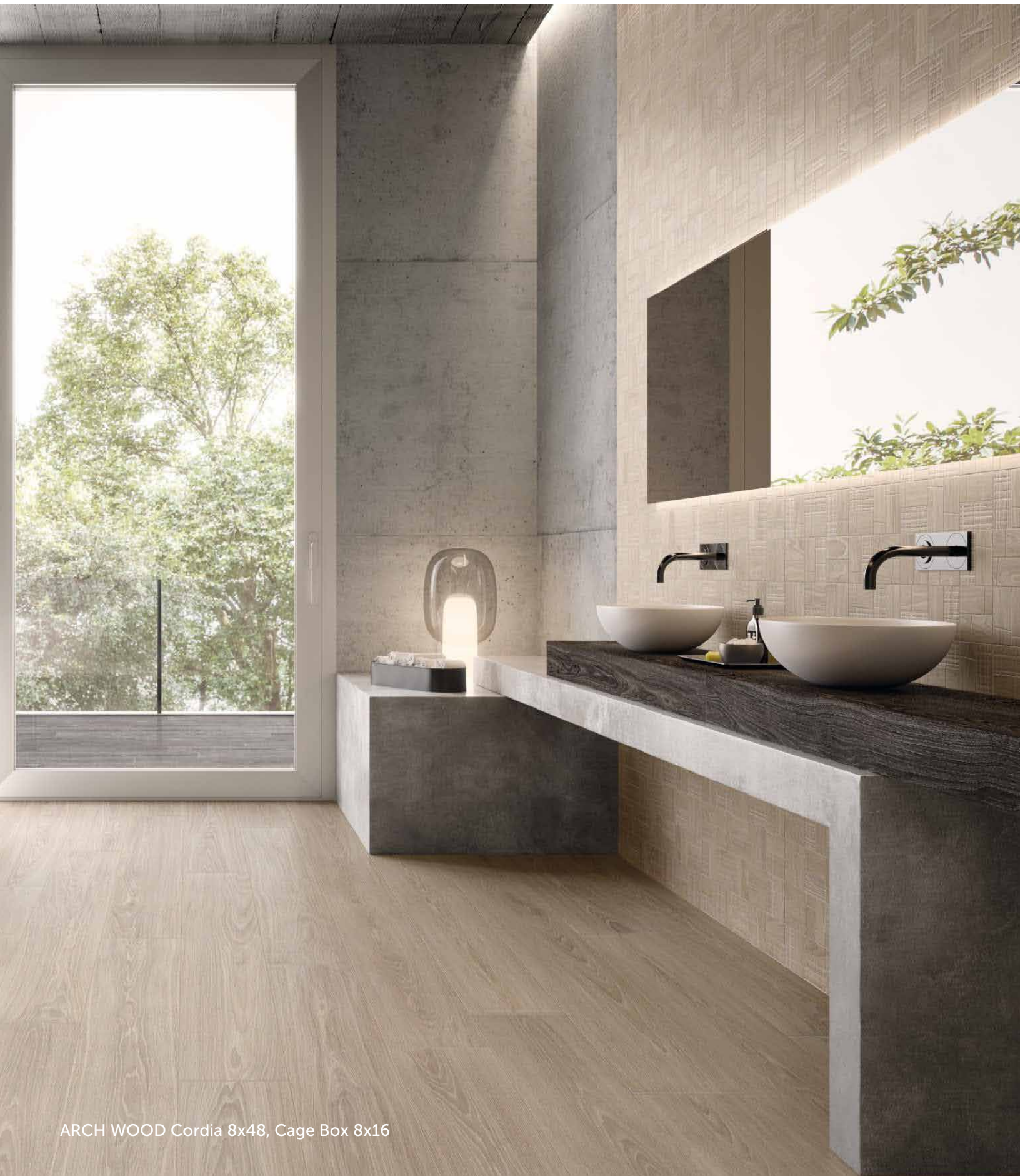
ARCH WOOD Cordia 8x48, Cage Box 8x16