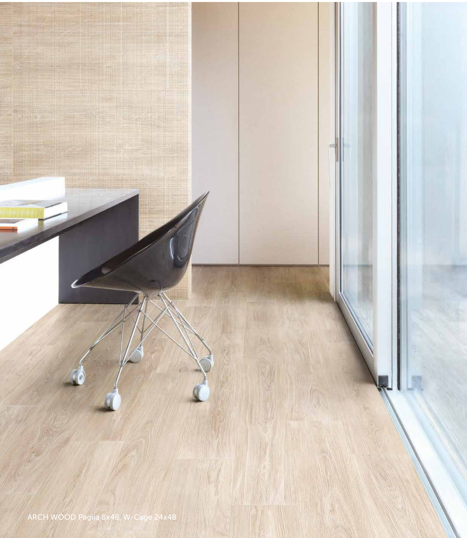
ARCH WOOD Paglia 8x48, W-Cage 24x48