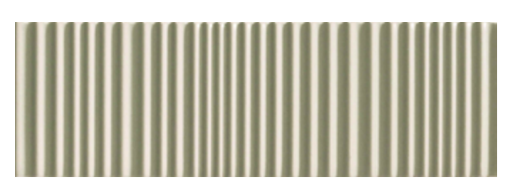
2.83 X 8.752 IVORY (Trend Linear)