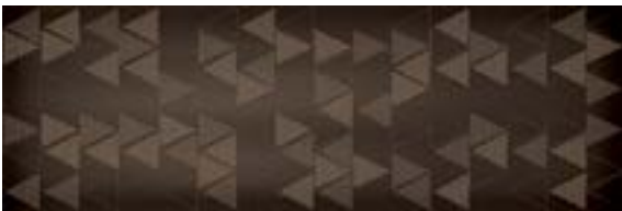
Mink - Move