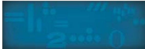
Ocean - Move