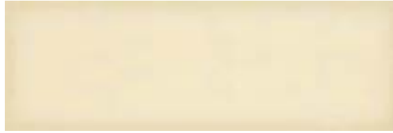
Sand - Move