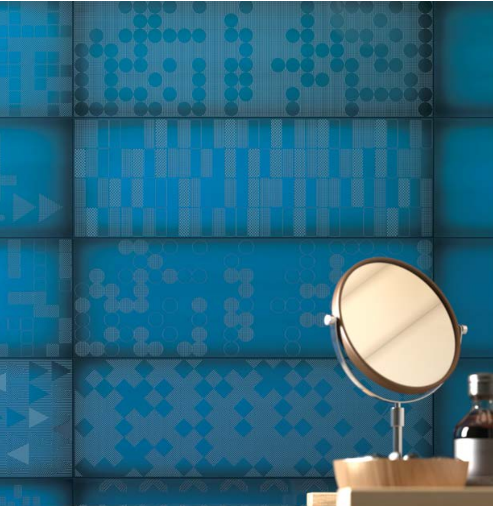
SURGE Ocean - Move 8x24