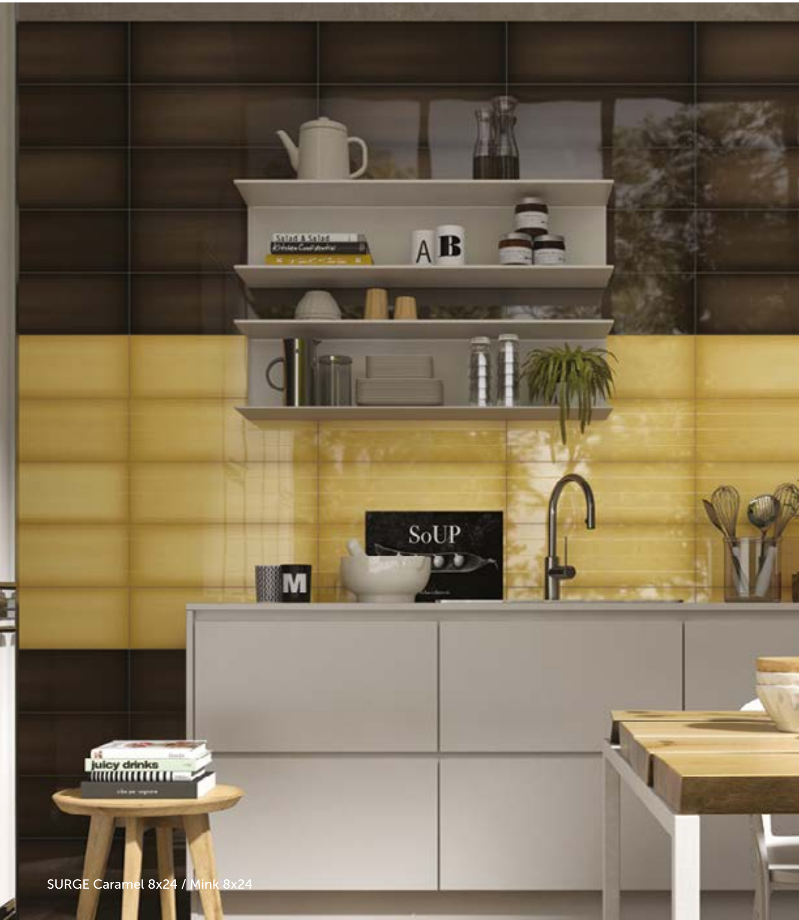
SURGE Caramel 8x24 / Mink 8x24