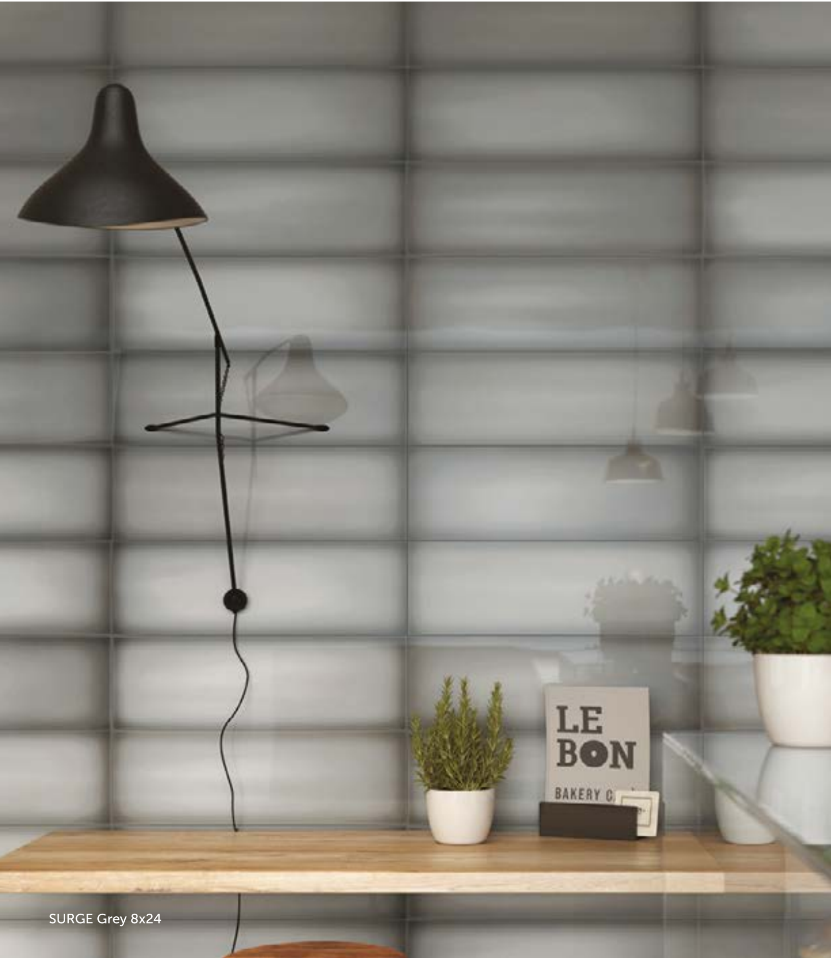
SURGE Grey 8x24