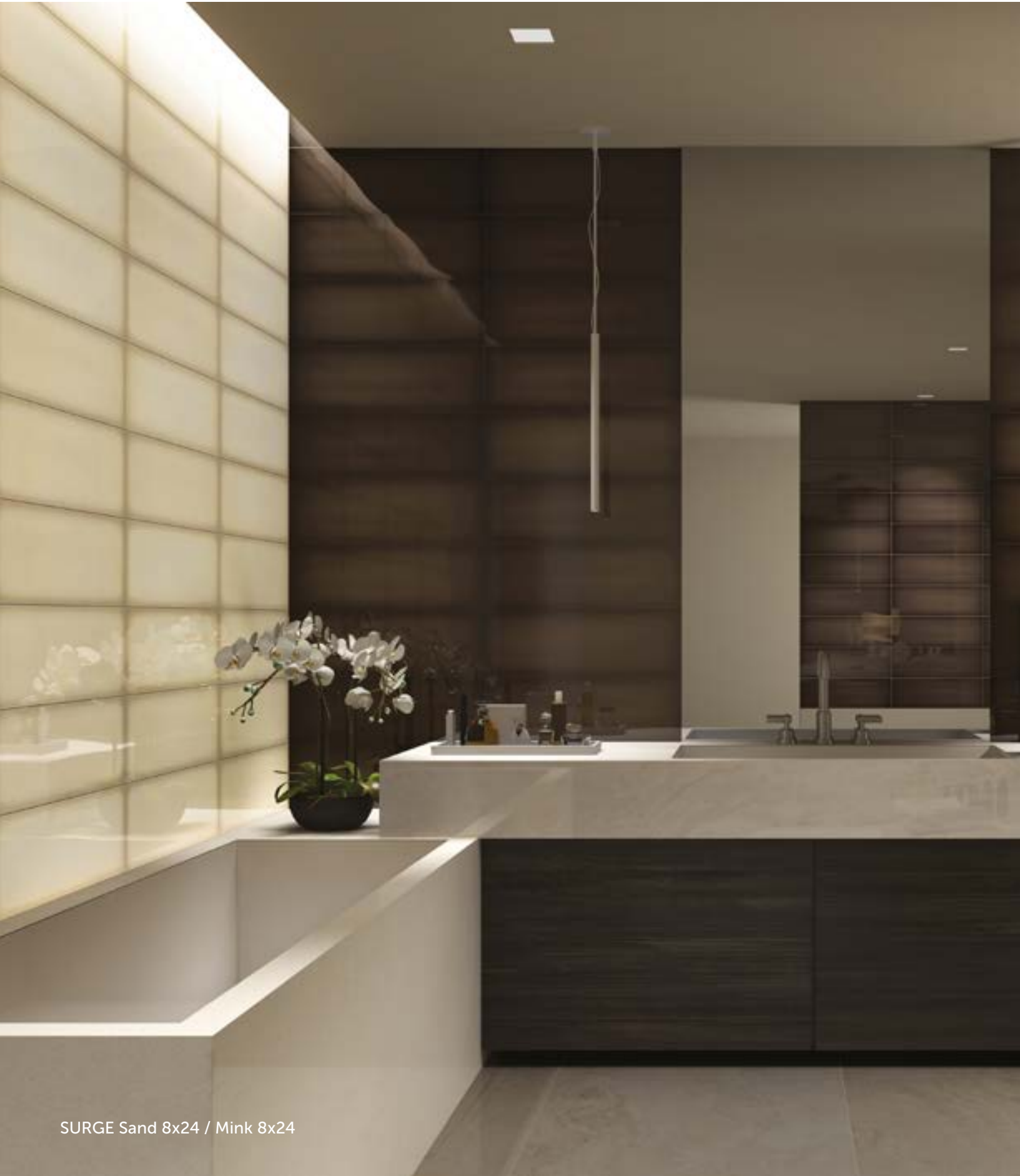
SURGE Sand 8x24 / Mink 8x24