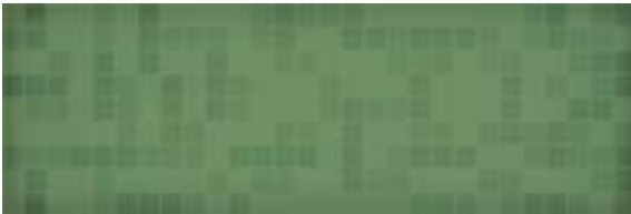
Emerald - Move