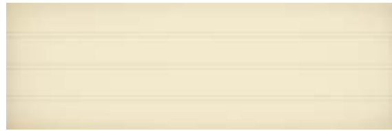
Sand - Form