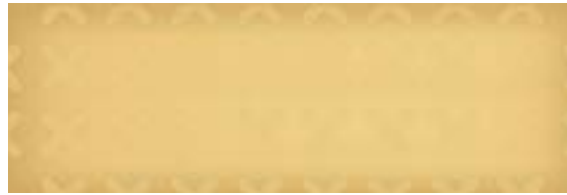
Caramel - Move