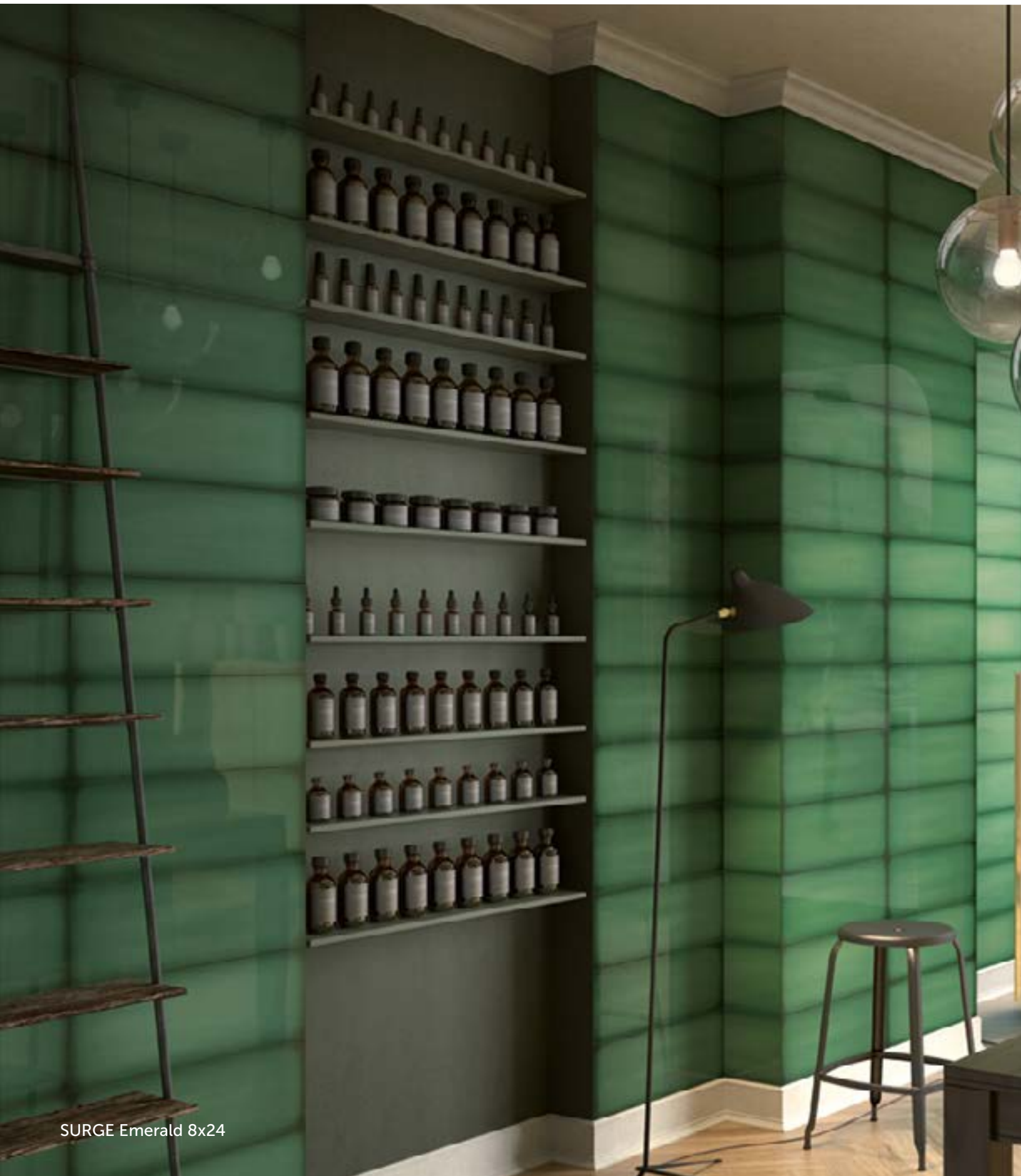
SURGE Emerald 8x24