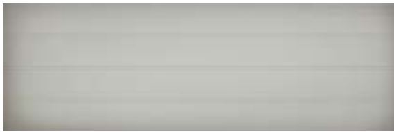
Grey - Form