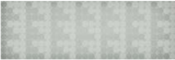
Grey - Move