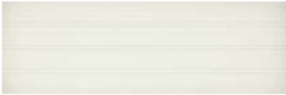
White - Form