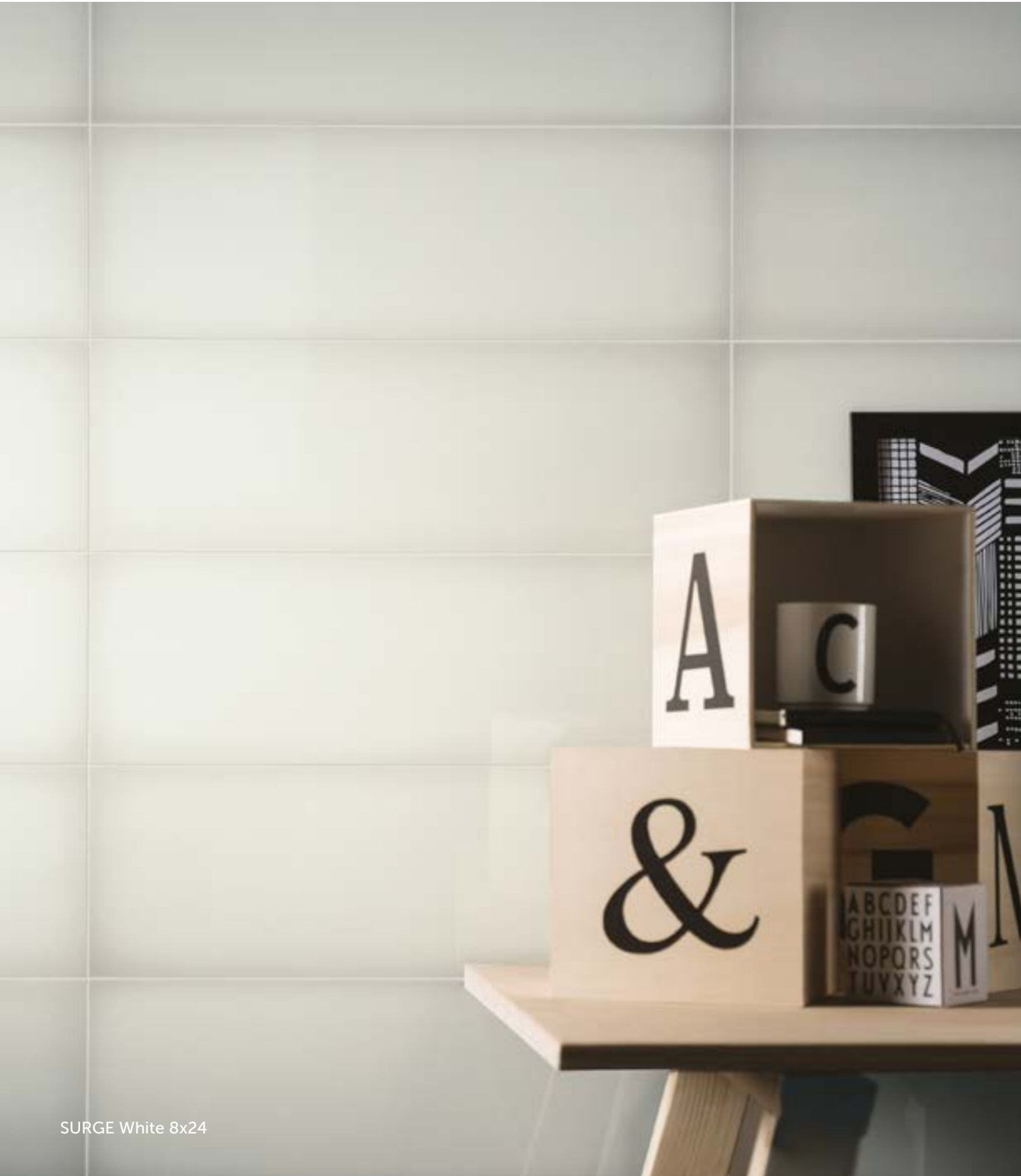
SURGE White 8x24