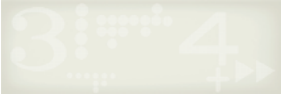
White - Move