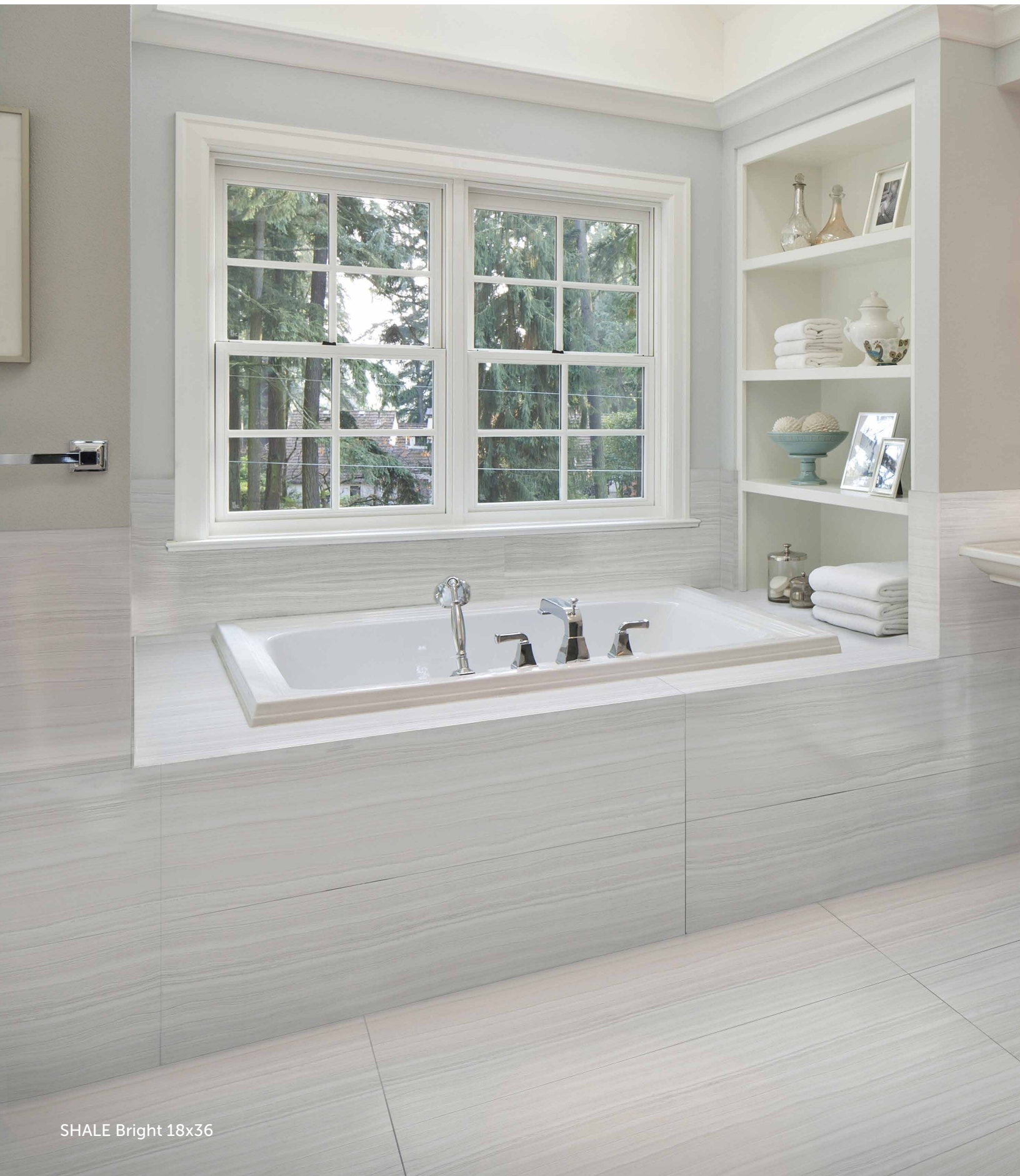
SHALE Bright 18x36