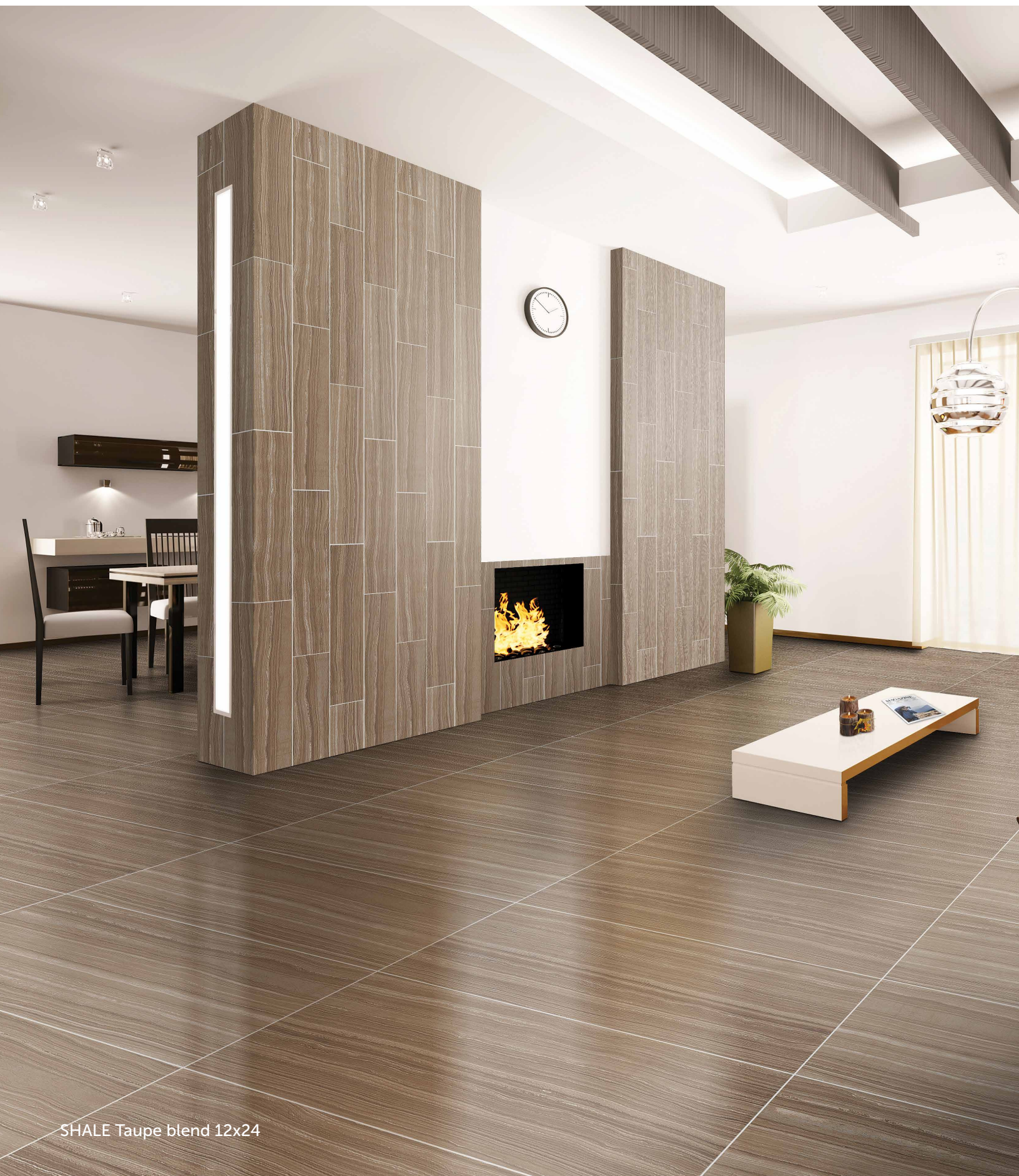
SHALE Taupe blend 12x24