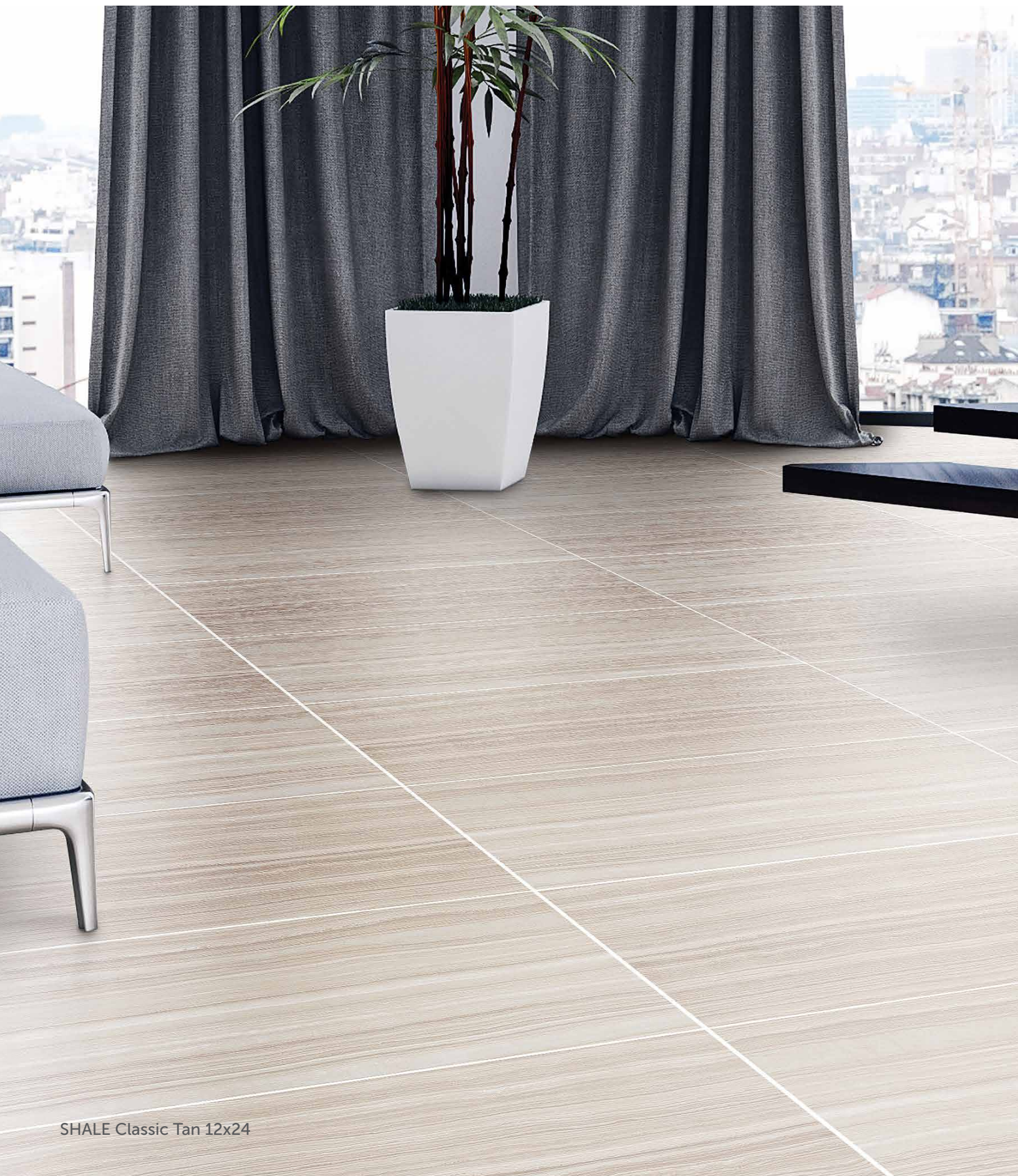
SHALE Classic Tan 12x24